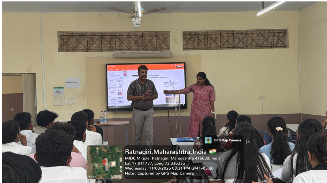
Civil defence training in action—building preparedness and resilience