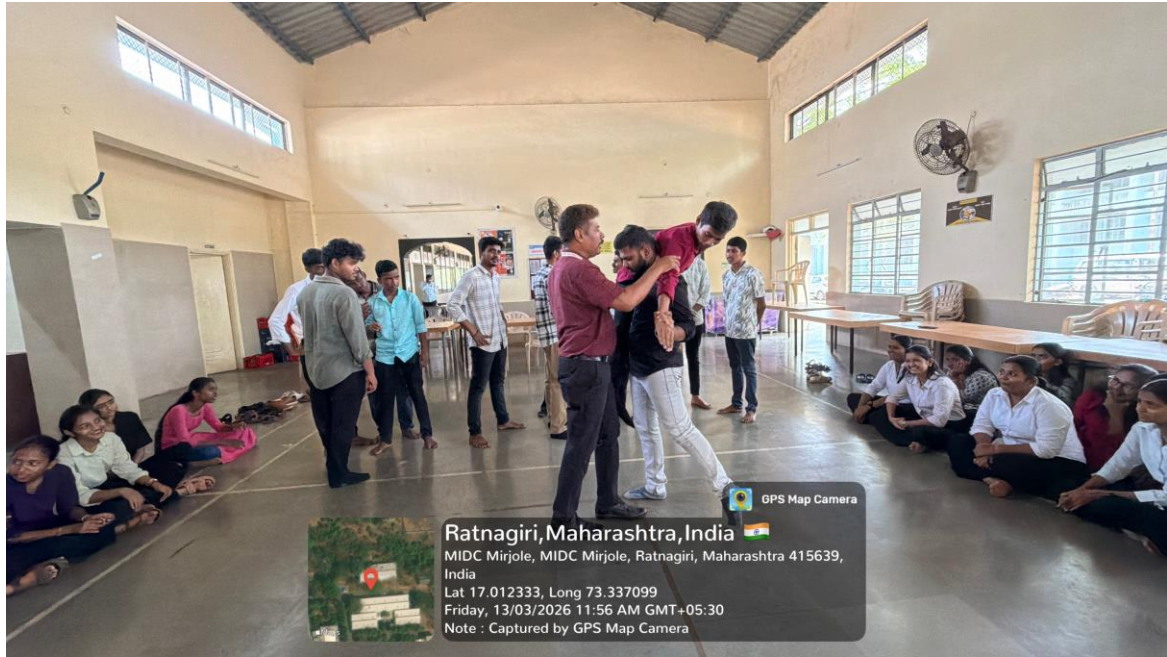
Students practising rescue techniques under expert guidance