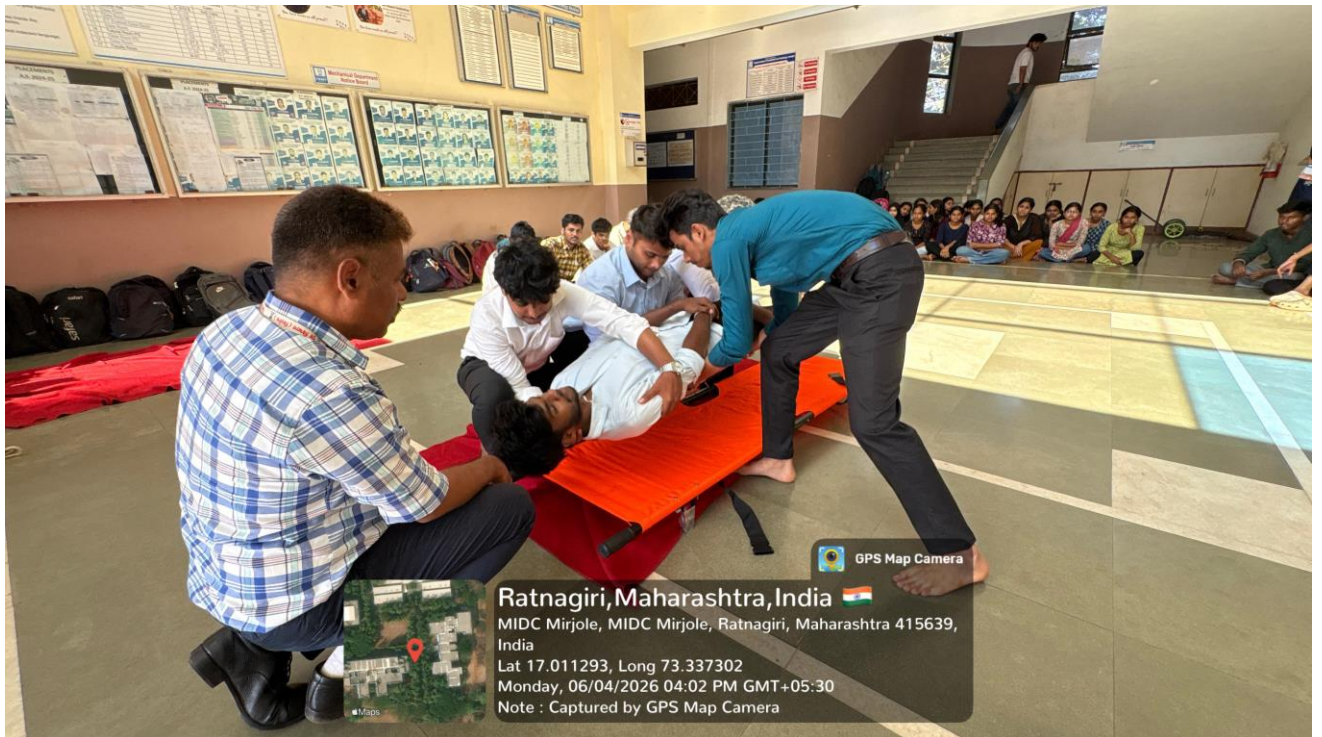
Participants learning Essential Life-Saving Techniques