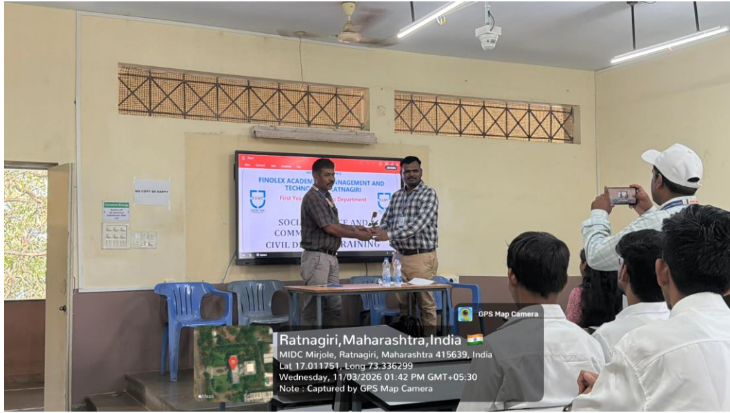
A respectful welcome to our distinguished guest