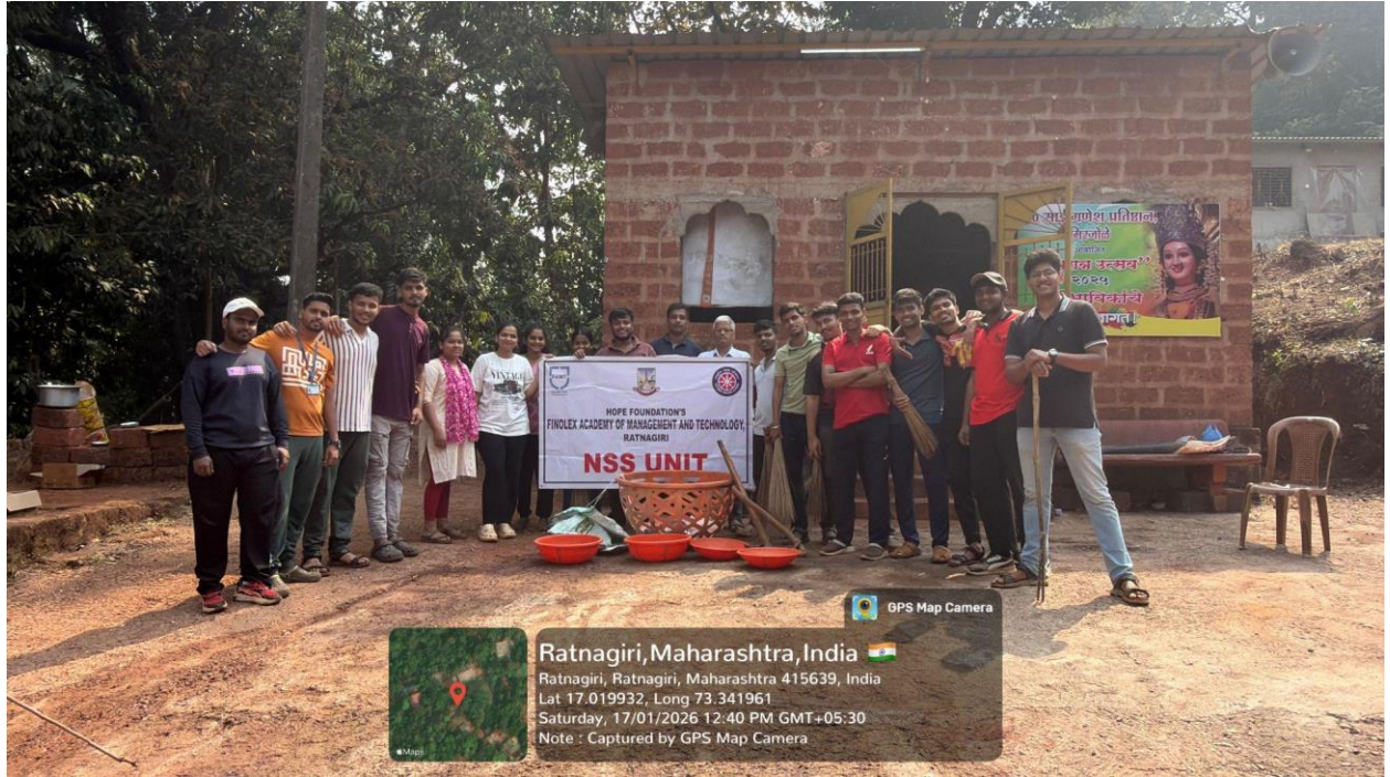
Clean surroundings—together we made a difference!