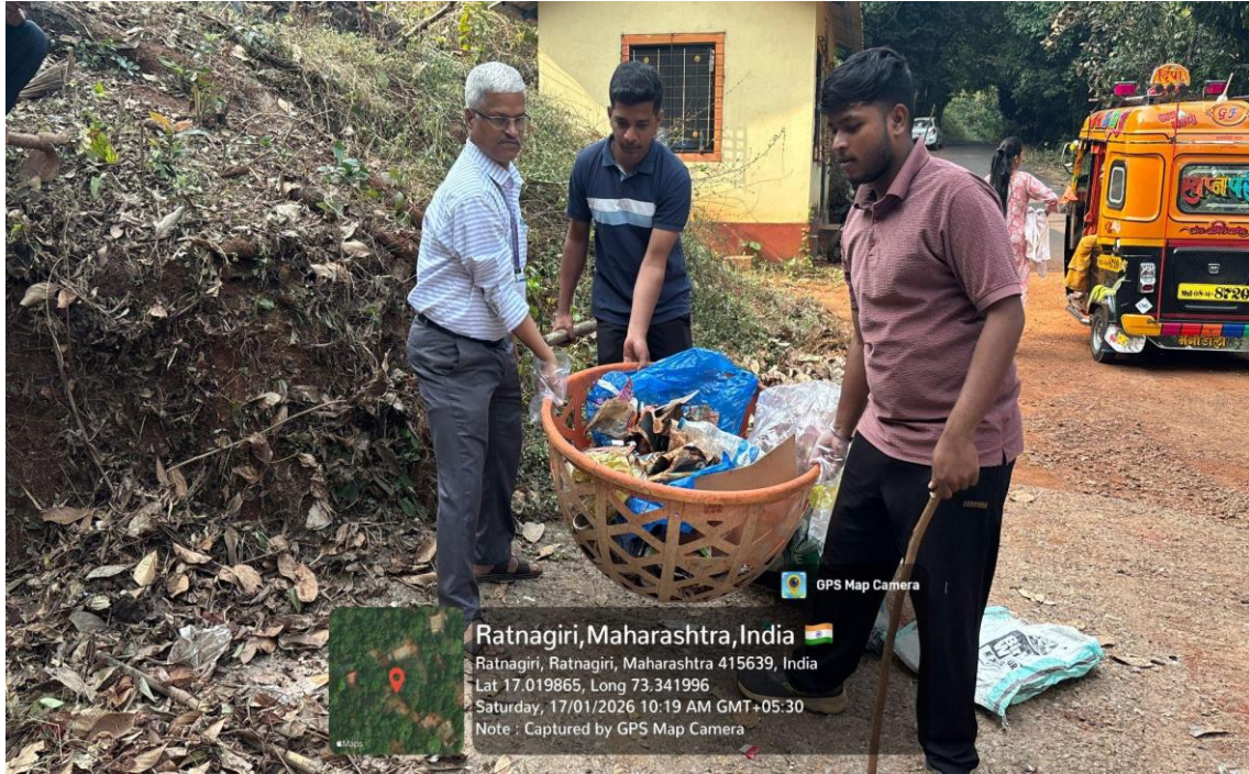
Less waste, more pride!