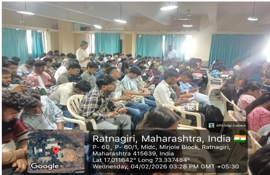
Students completing the registered course on the SkillsBuild Platform