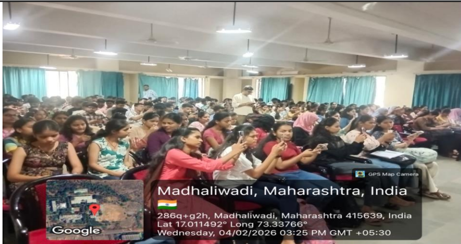
Students registering on the SkillsBuild Platform