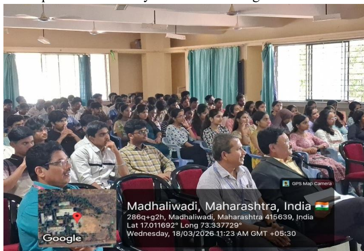
Faculty and students are listening to the speaker.