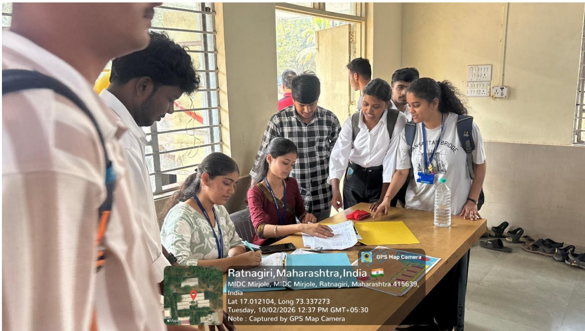
Volunteers Rolling Up Sleeves, Saving Lives