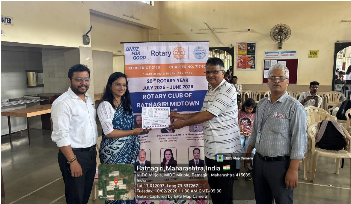
Honouring the donors with gratitude