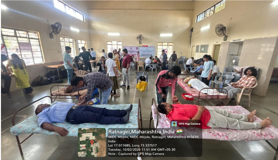
Faculty, Staff and Students, together giving back to society