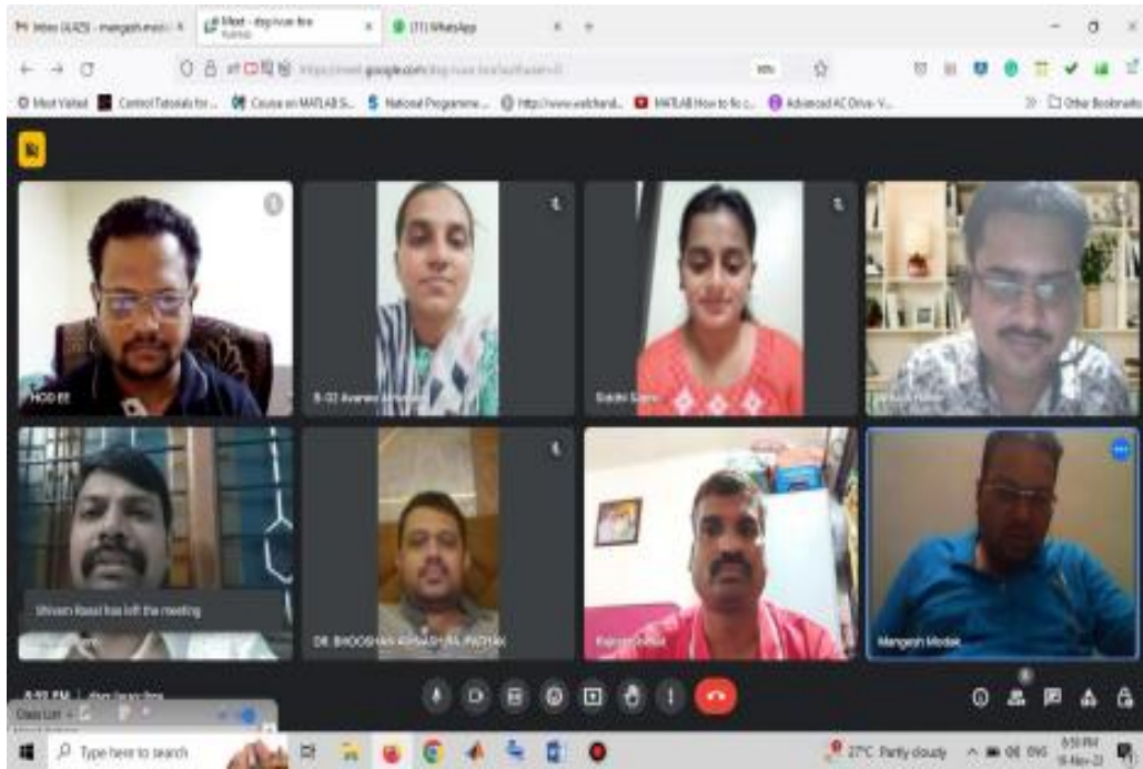
Screenshot of the Departmental Advisory Board Meeting