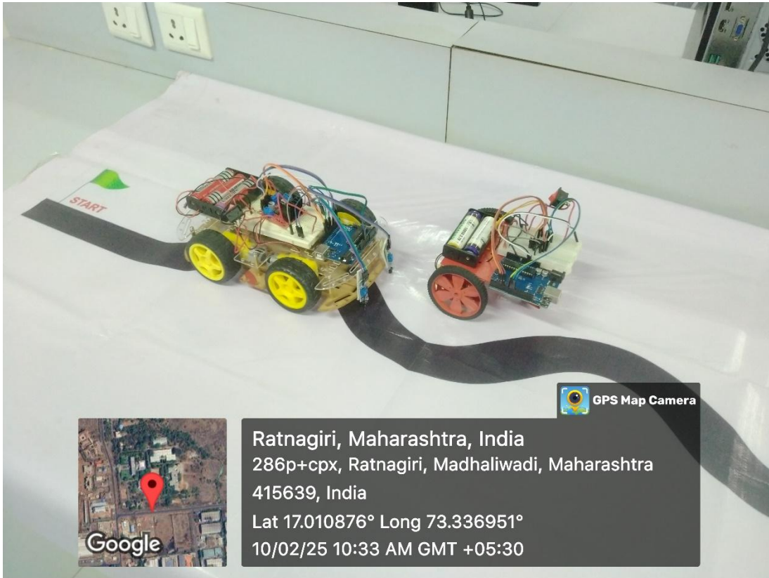
Robo Cars used in Arduino Workshop.