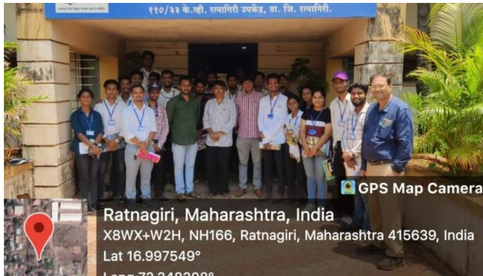
Electrical Engineering students and Faculty members