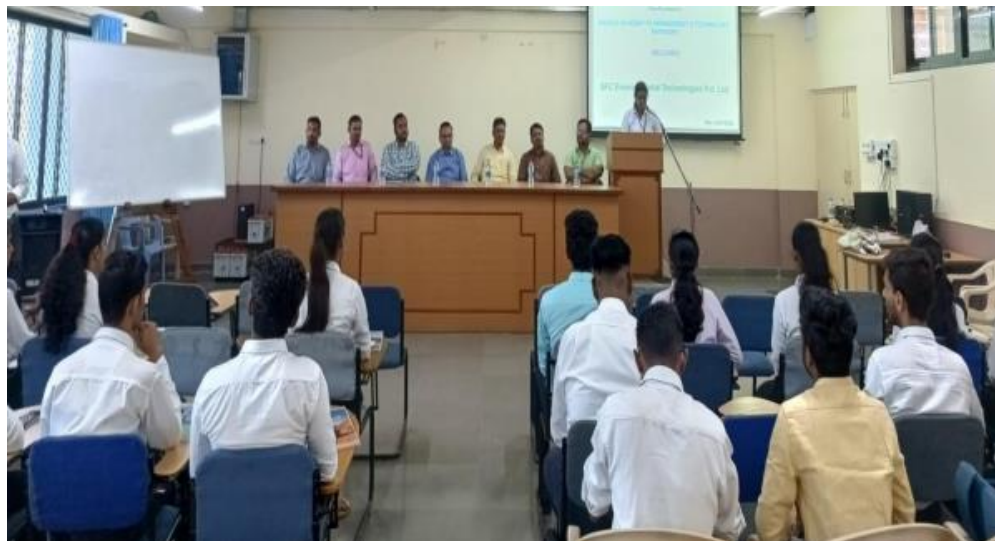
Inaugural Function at IT Seminar Hall in the presence of industry experts