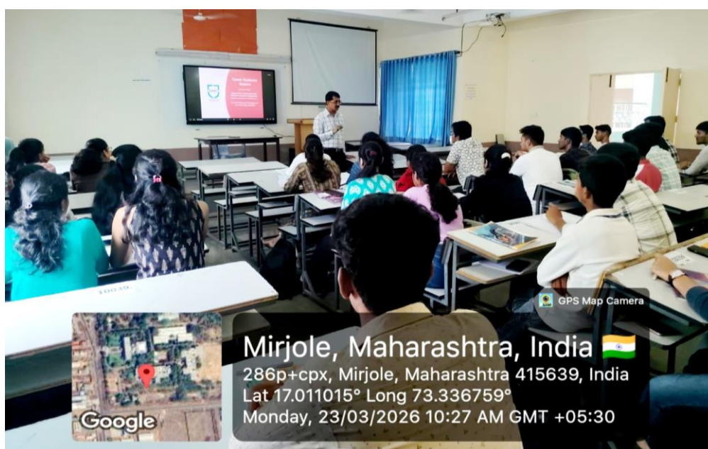
SE E&TC Students at the session