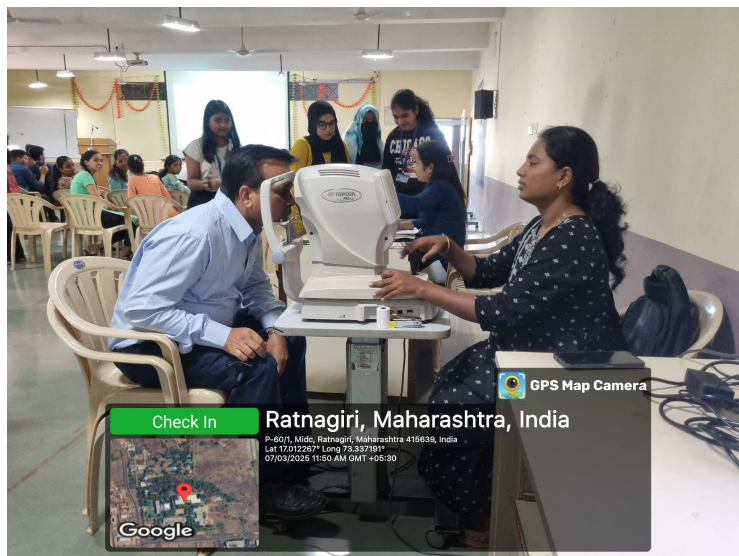
Students' registration for the camp, Professor's Eye Check-up by the INFOGO Doctor