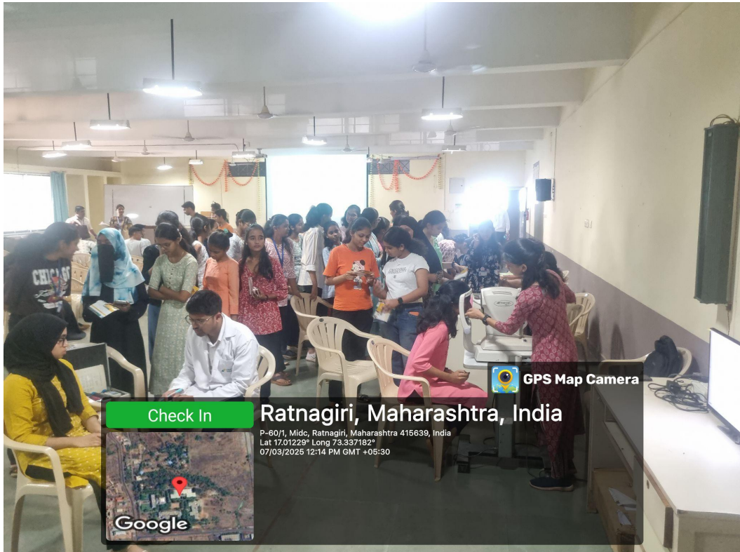
Students' Eye Check-up by the INFIGO Officials