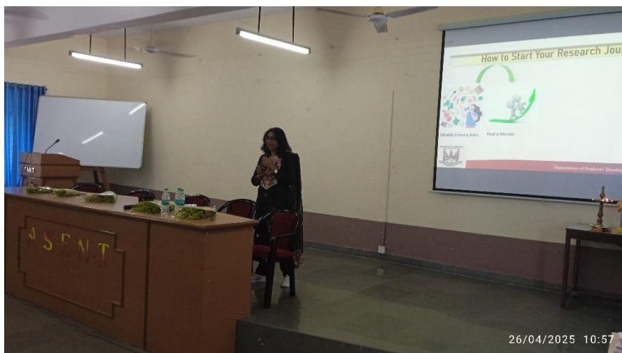
Photo: Experts guiding participants during the interactive session on research idea development.