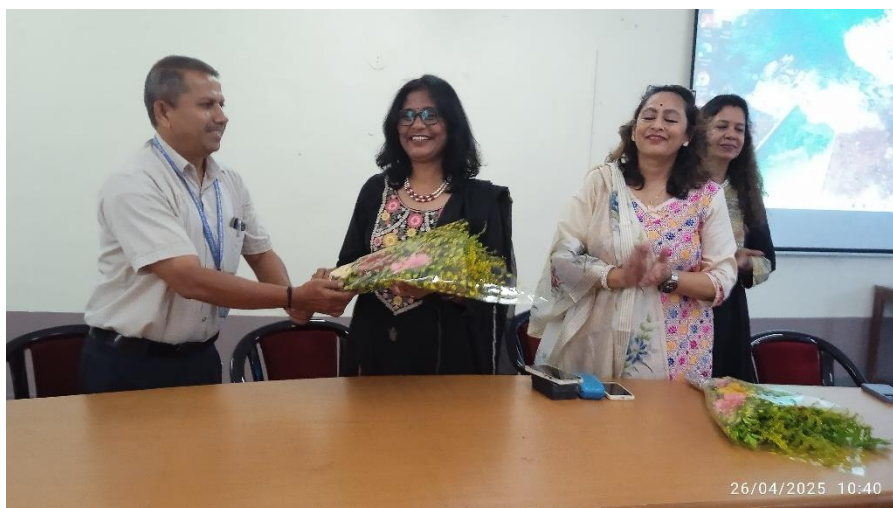
Photo: Felicitation of esteemed guests during the Summer Workshop for the 20th Aavishkar Research Convention 2025–26.