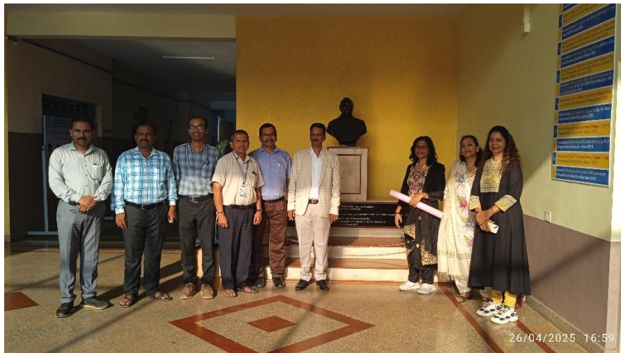
Photo: Group photo of dignitaries experts, and participants at the Summer Workshop

appointed as coordinators by the University of Mumbai, provided valuable support for the successful conduct of the event.