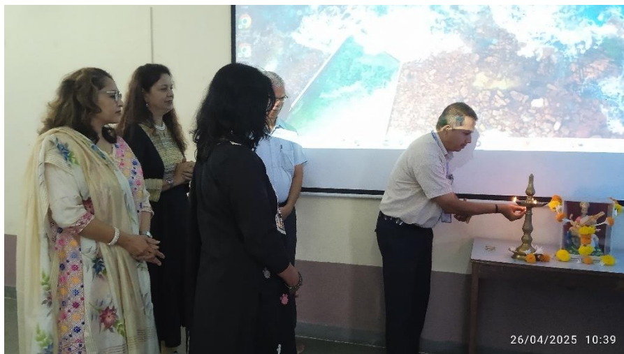
Inauguration of the Summer Workshop with the ceremonial lamp lighting by dignitaries at FAMT, Ratnagiri