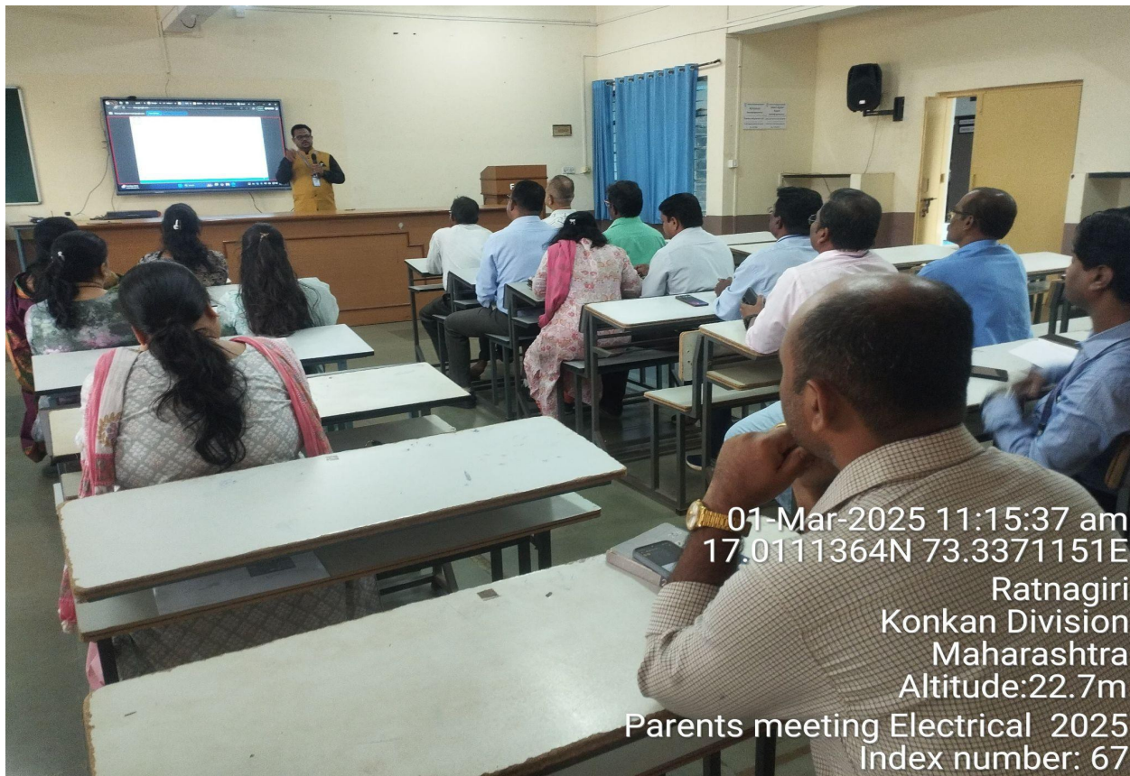
Parents and Department Faculty members listen patiently.