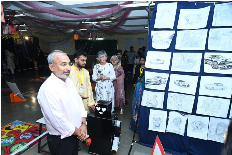
Visiting the Exhibition by Chief guests