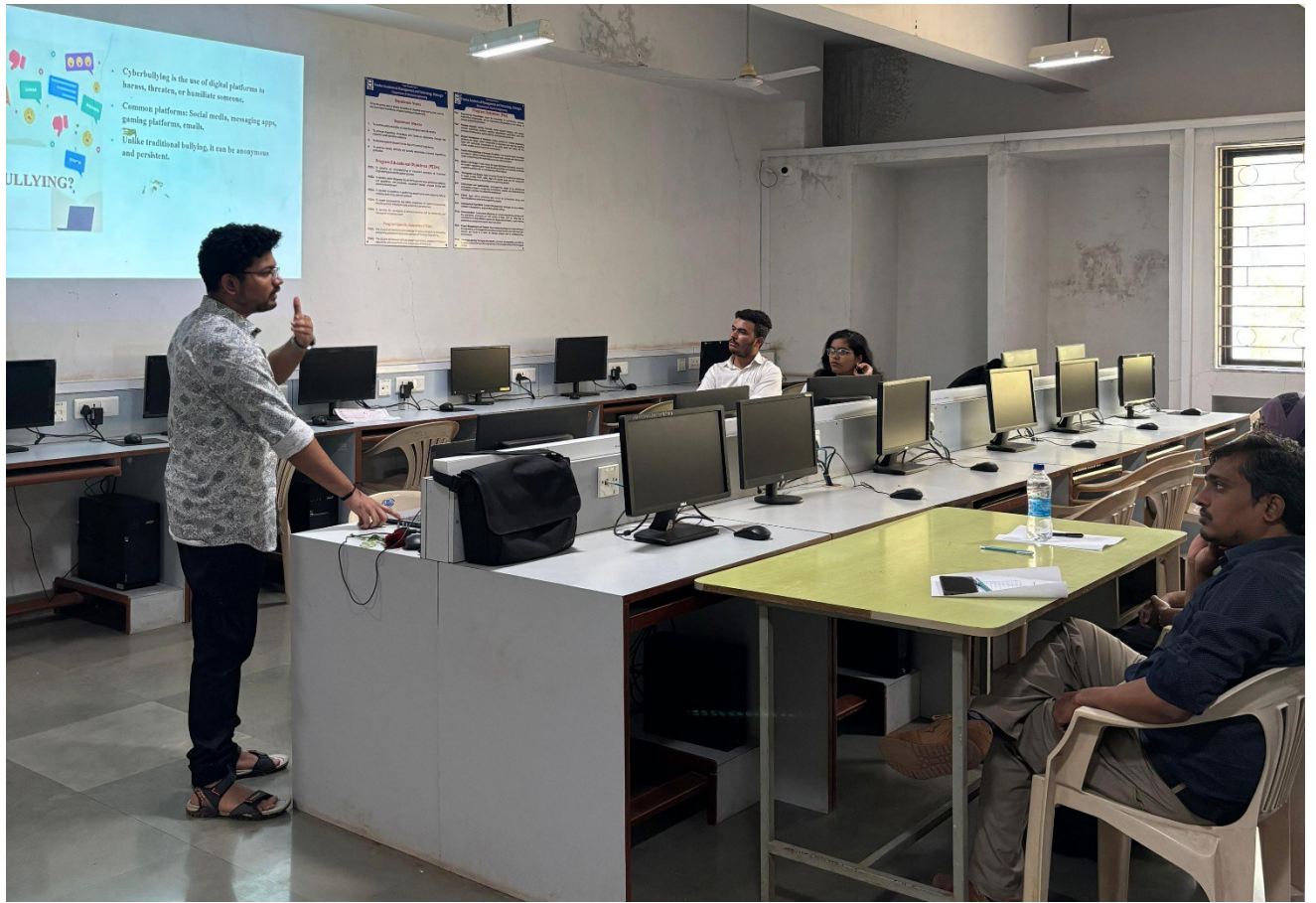
Project Presentation Event