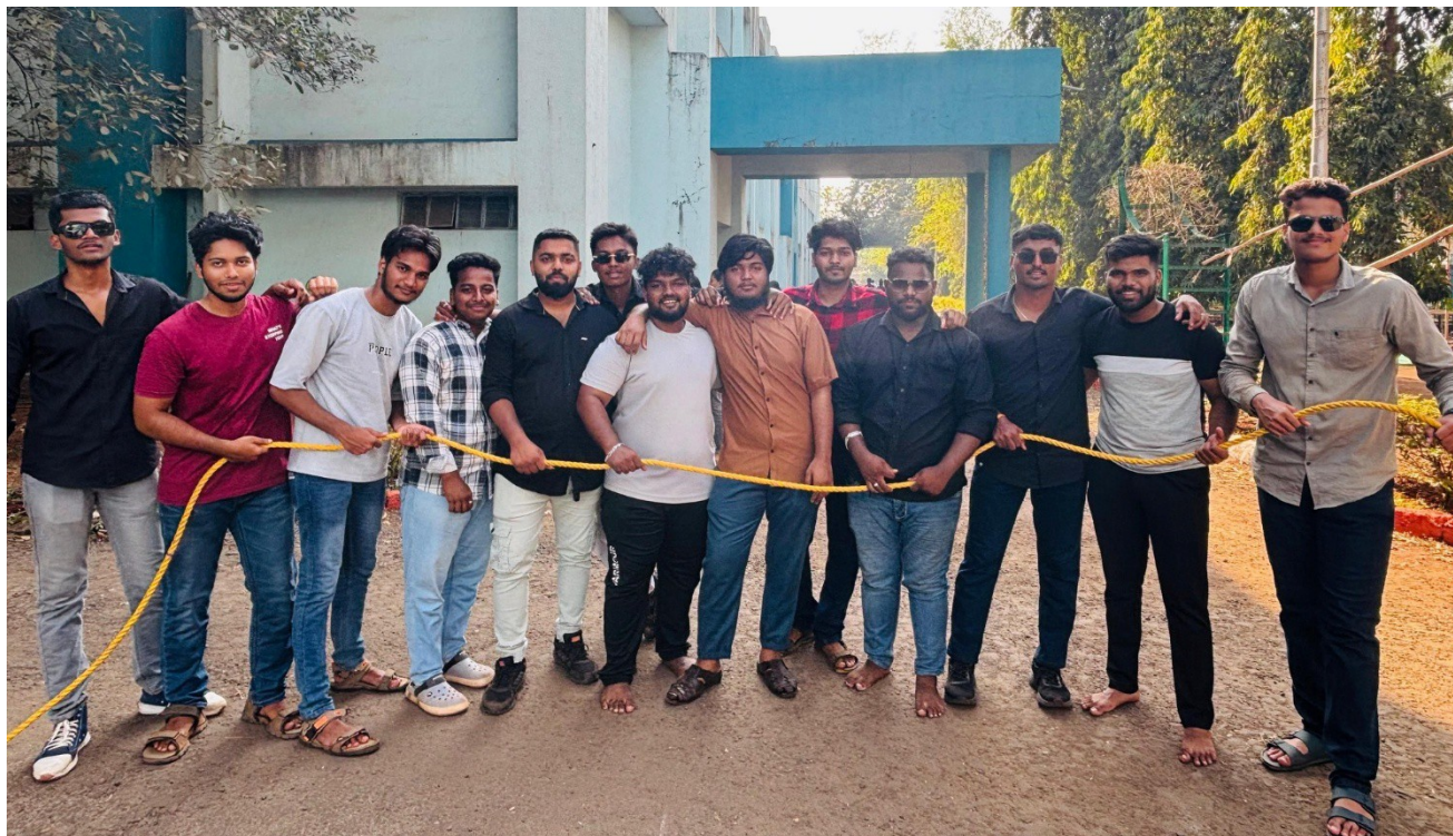
Tug of War Game