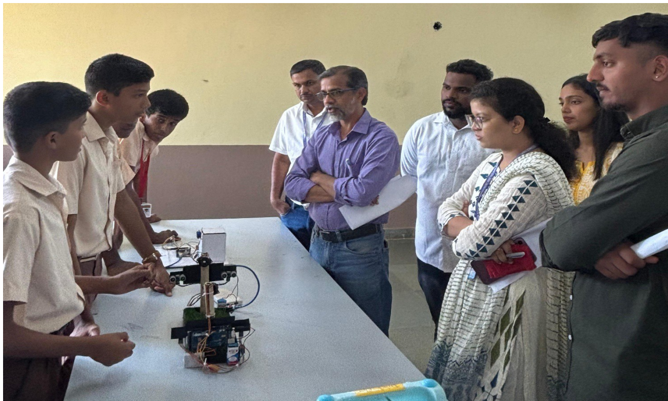
Project Exhibition Event