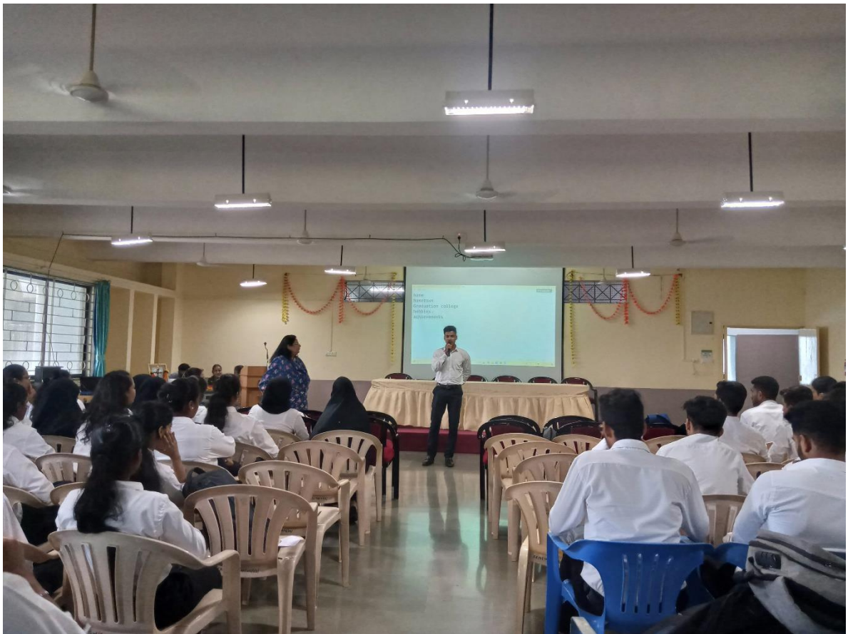
FY MCA Students introduction session