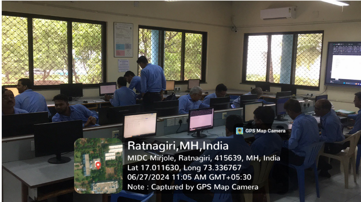
Participants were engaged during the training