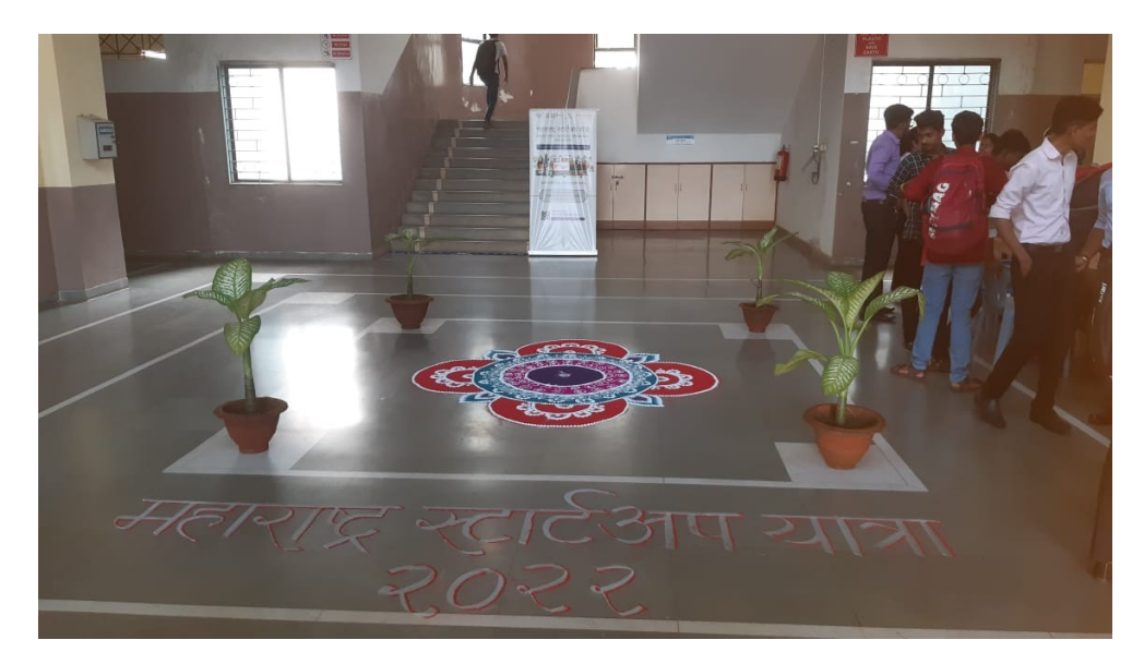
The Rangoli at the Entrance of the Mechanical Block.