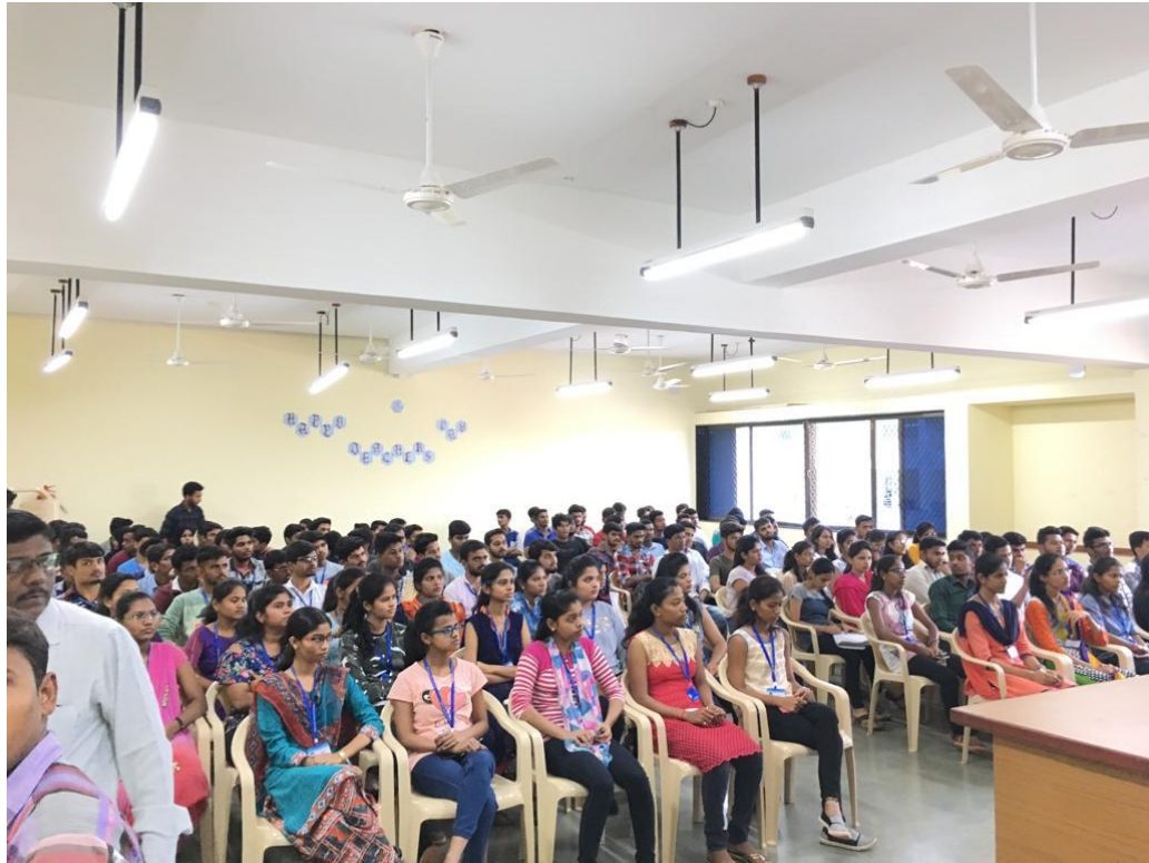
Students attending EVM VVPAT awareness programme