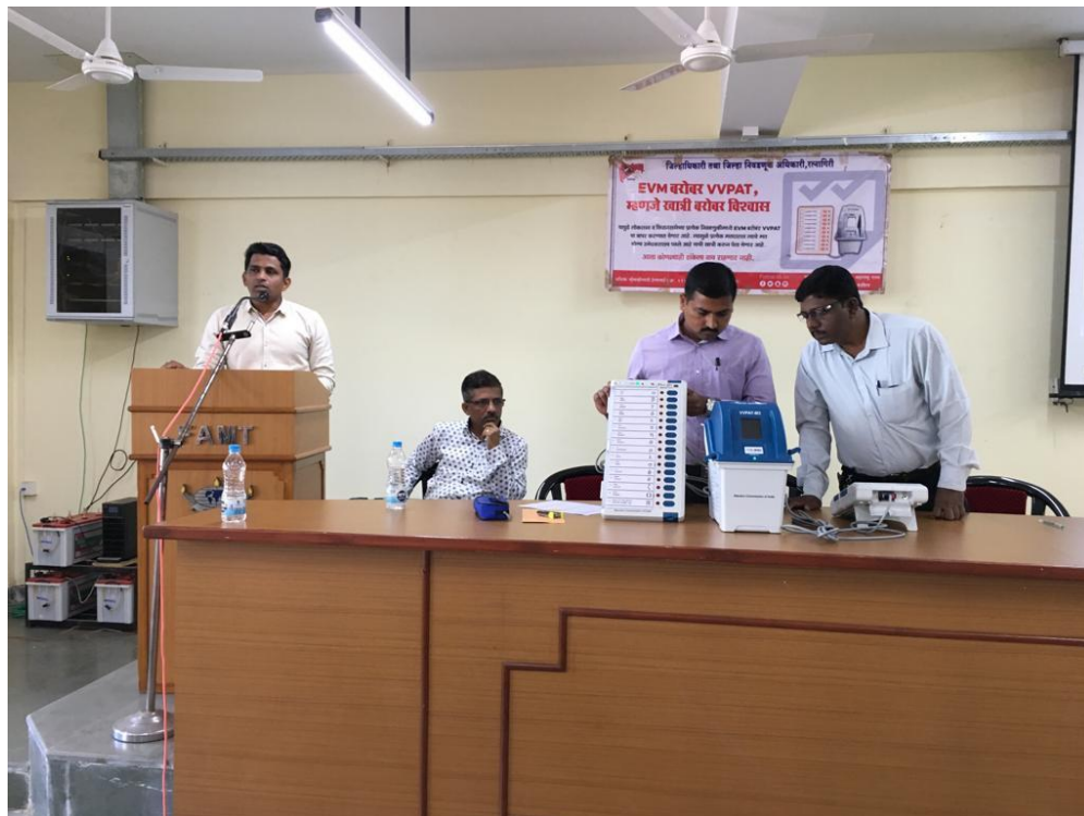
Demonstration of EVM VVPAT

The officers even interacted with the students about the functioning of EVM VVPAT and clarified their doubts about double voting, calculation of votes and so on by giving them the practical experience of the same. Many students attended the programme and understood the working of the machine.