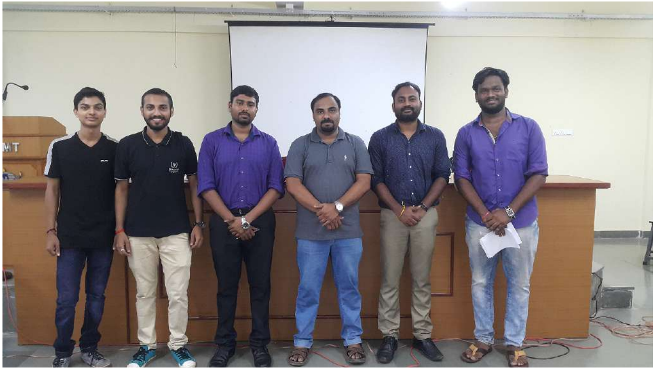
Workshop organizing committee with Delegates from SKYFi Labs, Bangalore