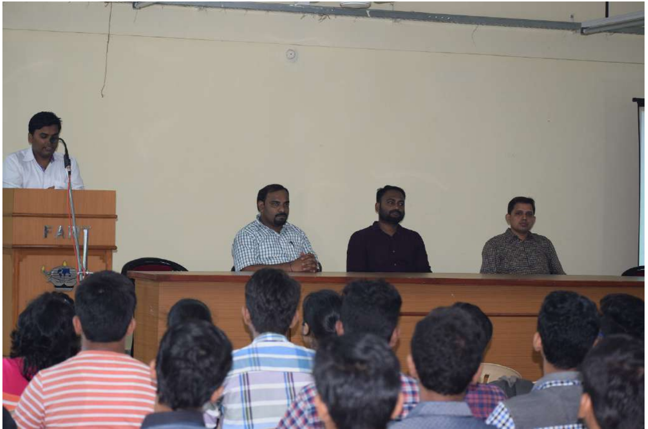
Inauguration ceremony of Workshop