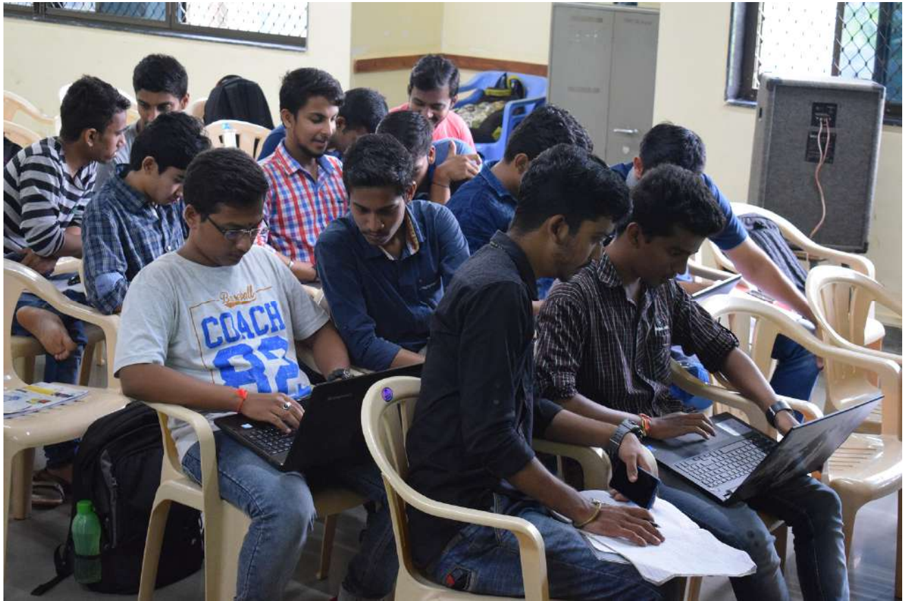
Engine Simulation Software demonstration during Workshop