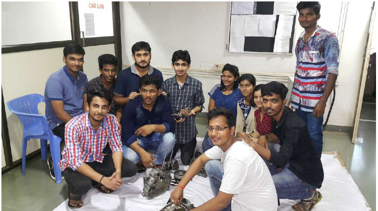
Workshop participants dismantling engine