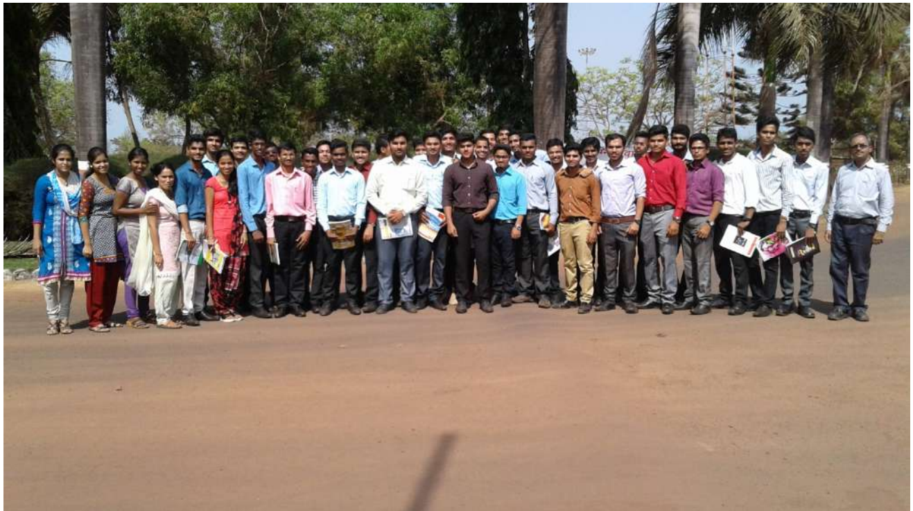
1 st batch on 20/04/2017