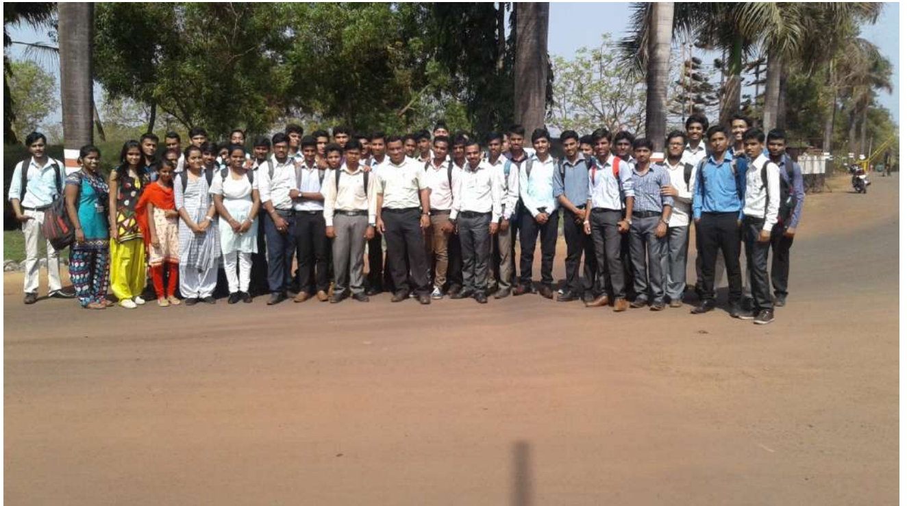
2 nd batch on 21/04/2017