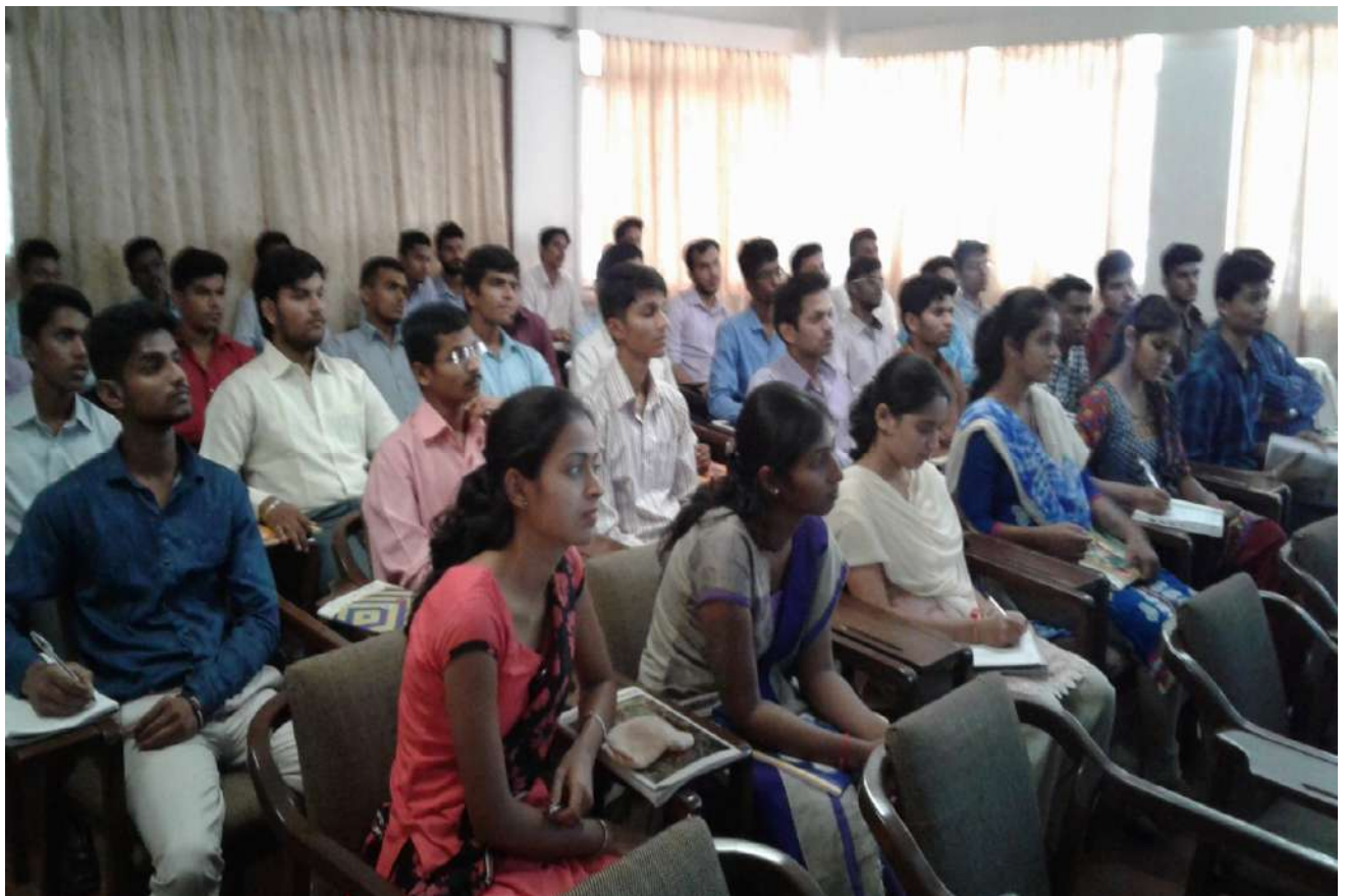
Students during interaction with industry experts