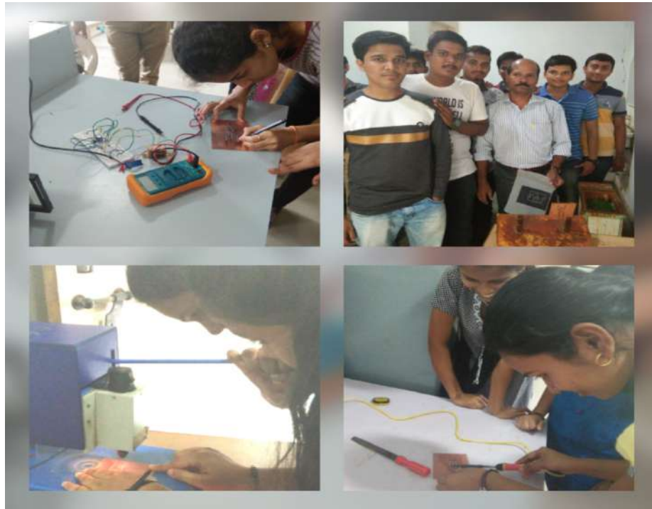
Hands on Practice for PCB making