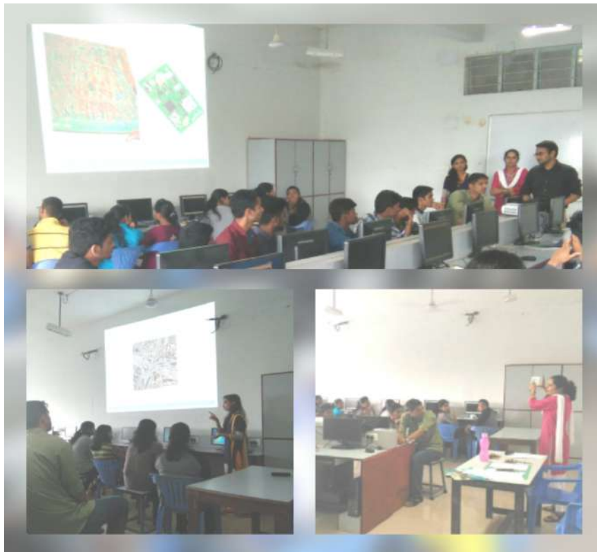
Interaction of participants with resource person