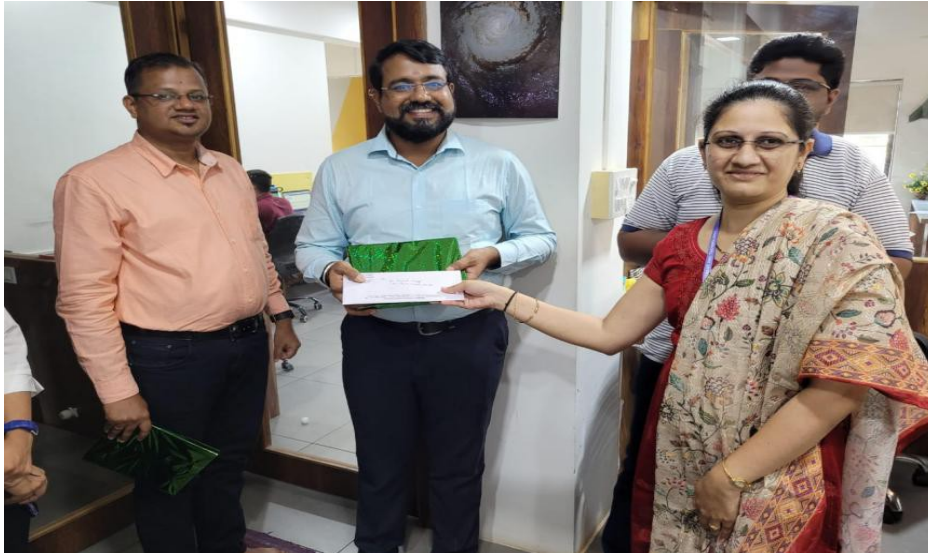
Initiating a new chapter: FAMT and Aryak Solutions setting the groundwork for the MoU.