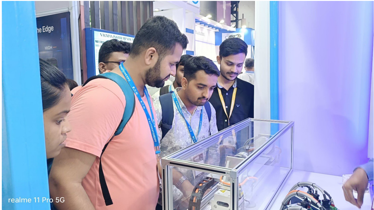
Students observe the technology showcased at the stall.