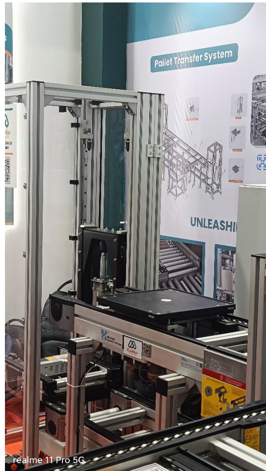
Automation technology was showcased at the exhibition.