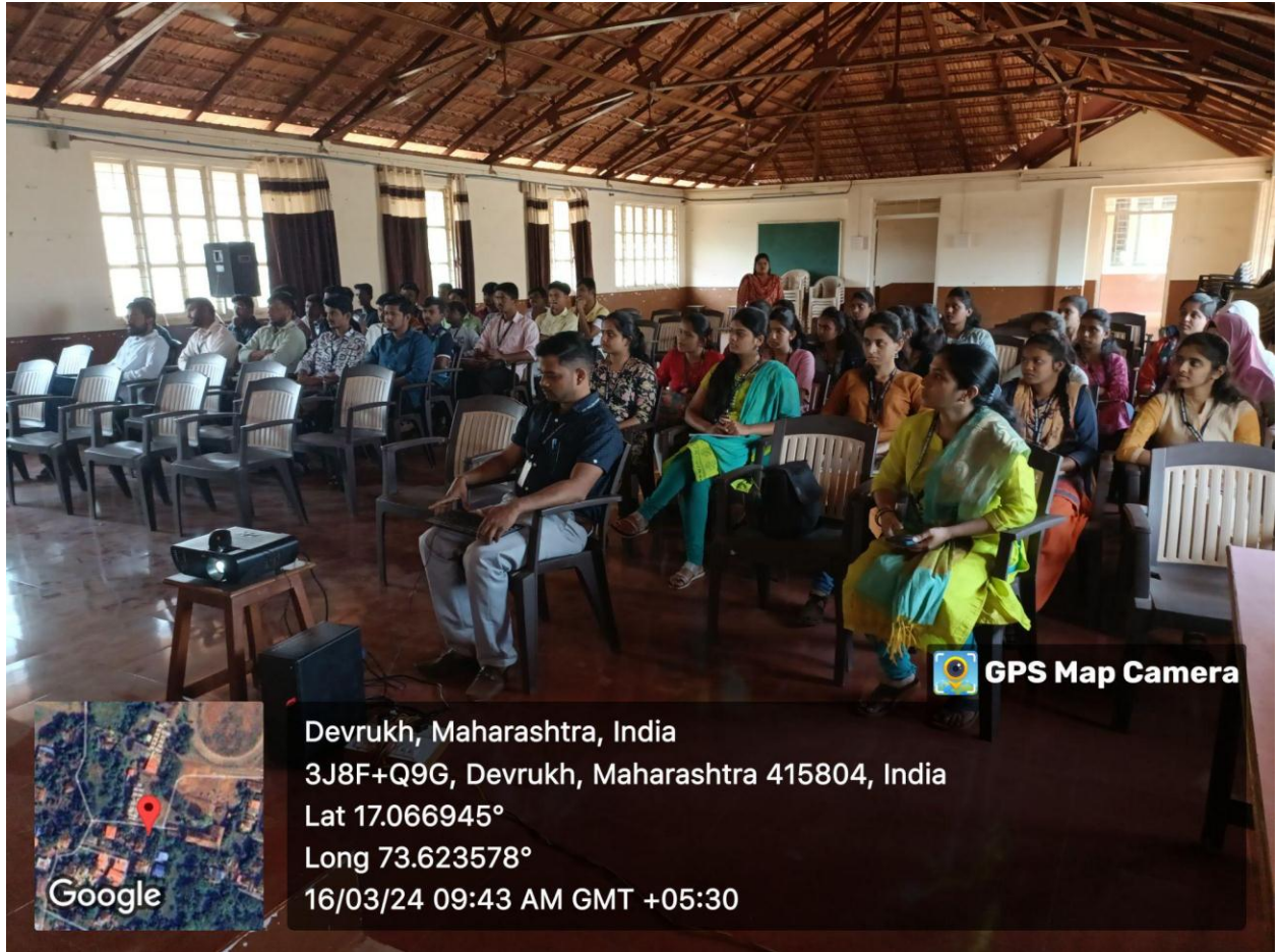
Students and teachers from ASP college listened to the seminar.