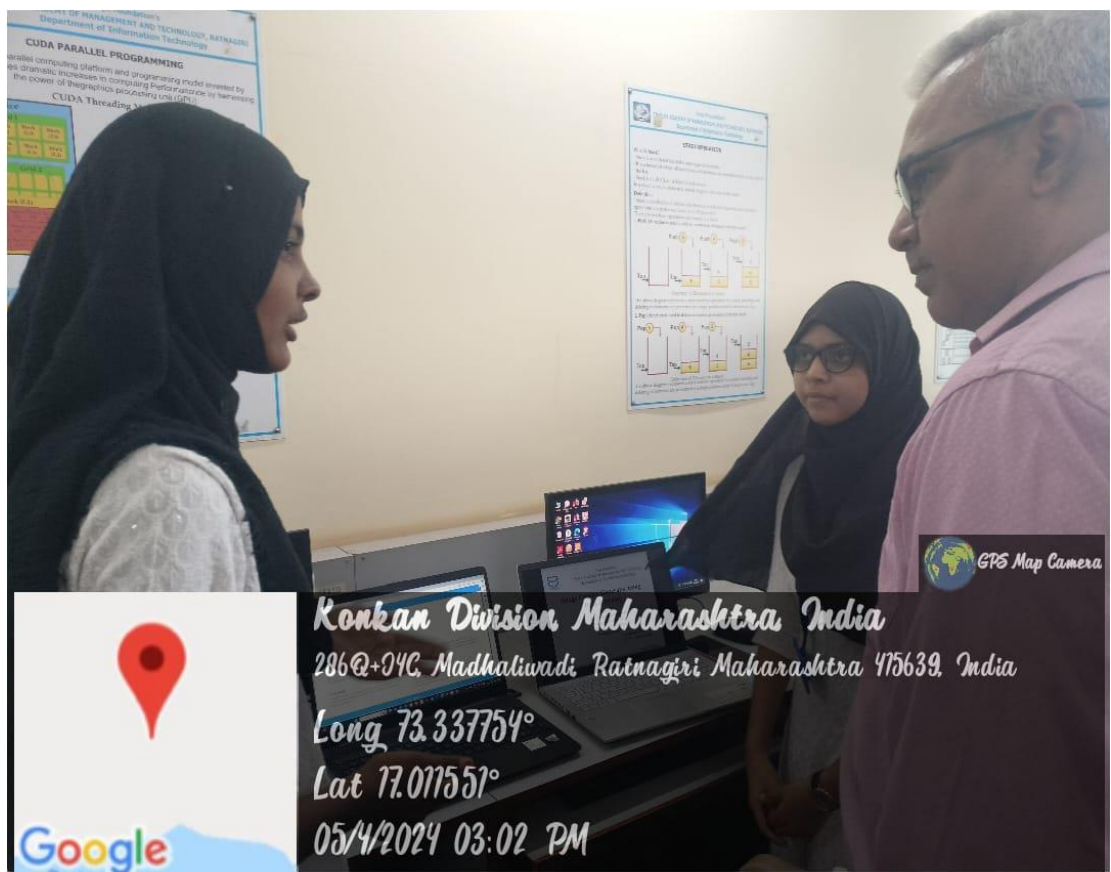
IT Students showcasing their project