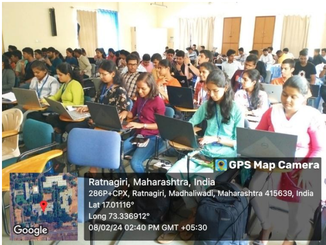
Students are actively listening and performing the workshop.