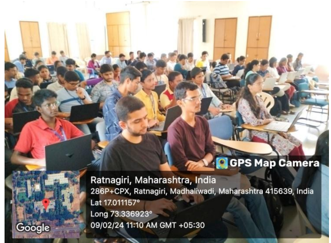
Students are actively listening and performing the workshop.