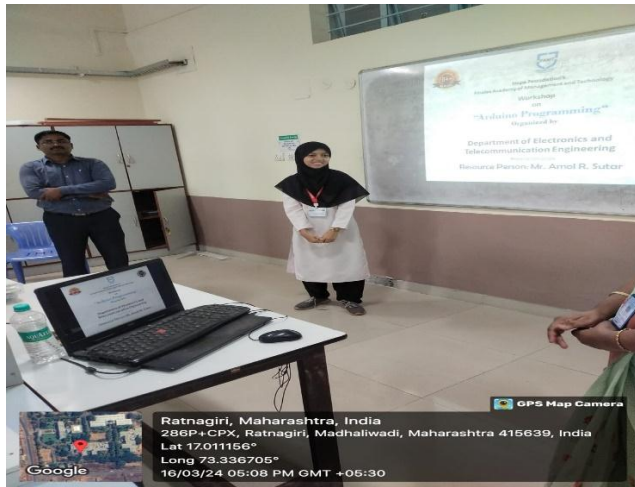
Feedback by students