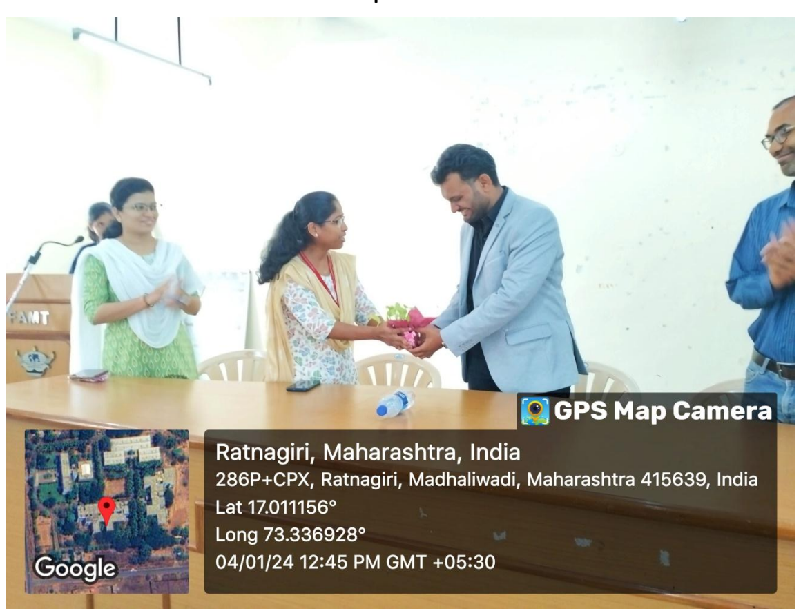
Photographs of the event: A CyberMinds Talk: Navigating Security for Students and Entrepreneurs

Prof.V.V.Nimbalkar, HoD CSE (AI & ML), is felicitating the resource person