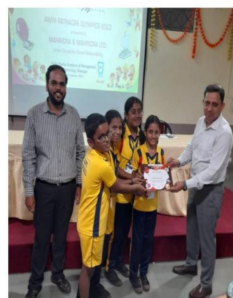
Runner up Jet Toy GGPS English Medium High School