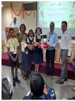
Runner up Skimmer GGPS English Medium School