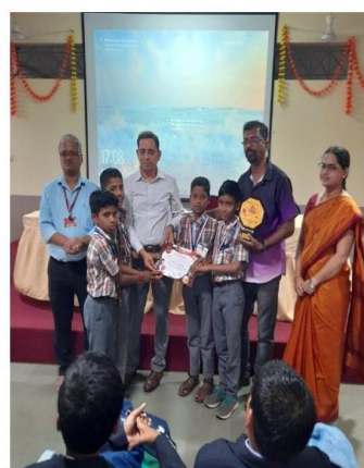
Winner Jet Toy Swami Swarupanand High School