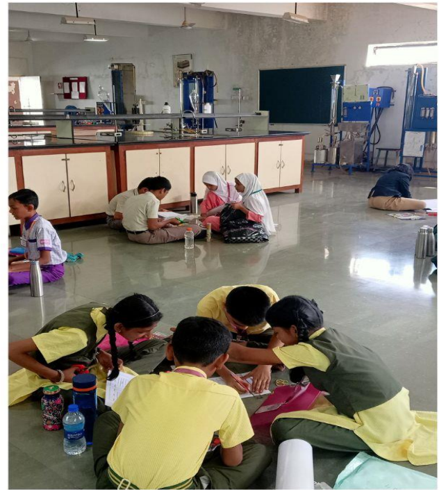
Students while doing project activity