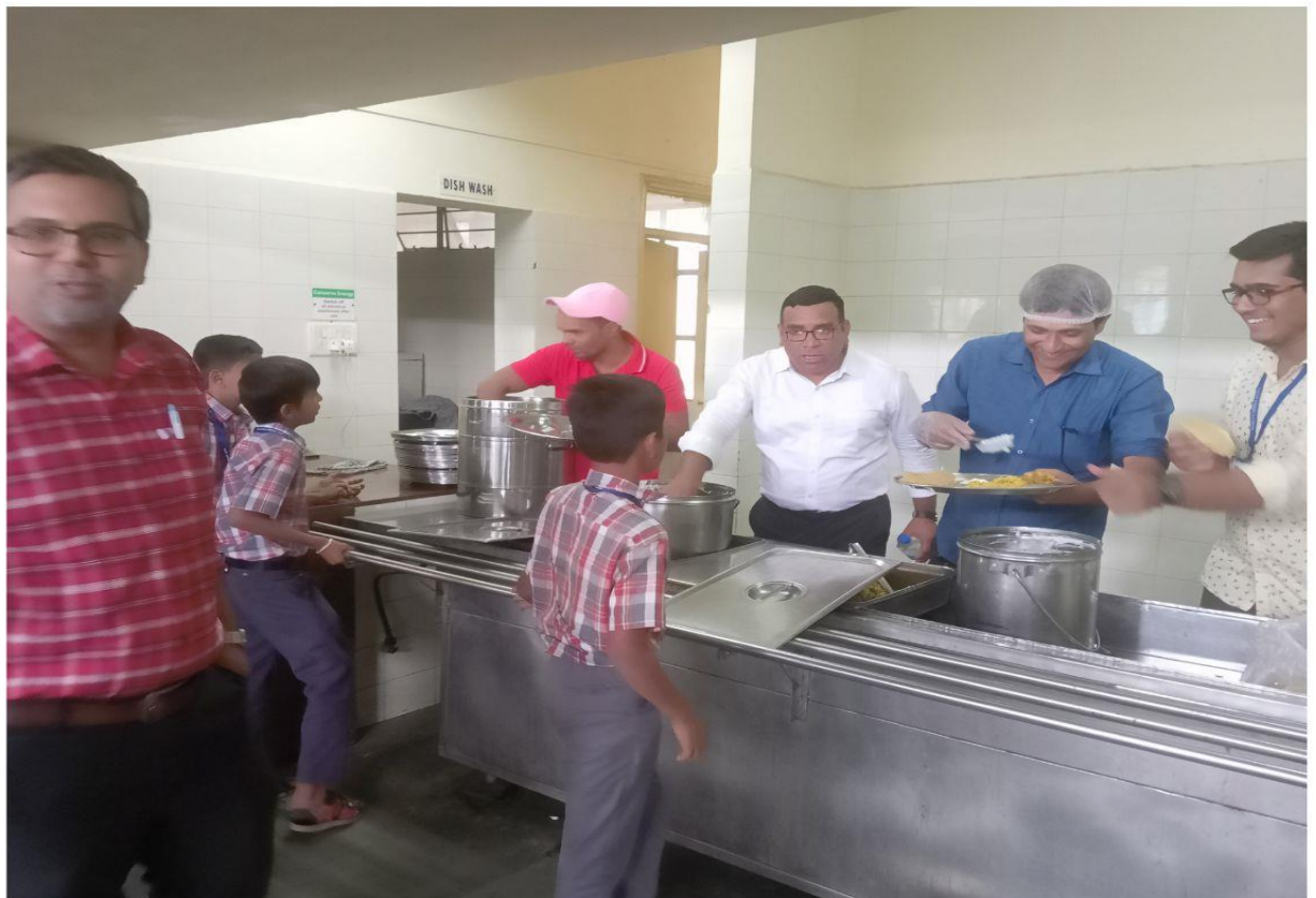
NSS Volunteers' Participation in the registration process and at the food counter