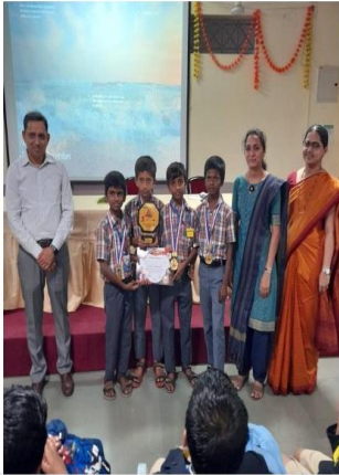
Winner Skimmer Swami Swarupanand High School