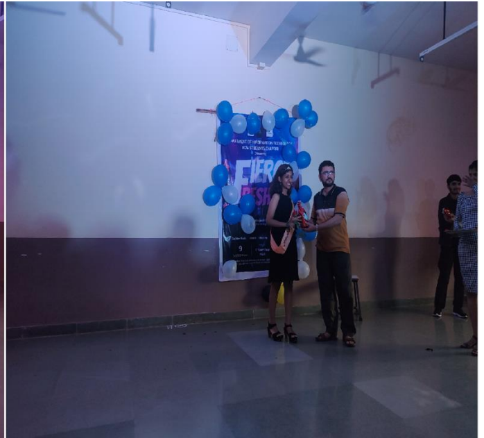
Felicitation of students