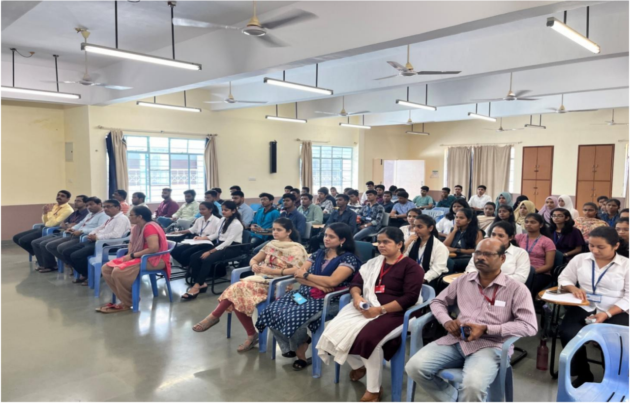
Faculty members of EXTC Dept. and students on occasion of Engineer's and Teacher's day