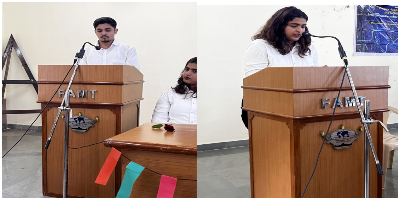
Faculty members and Students of EXTC Department expressing their views