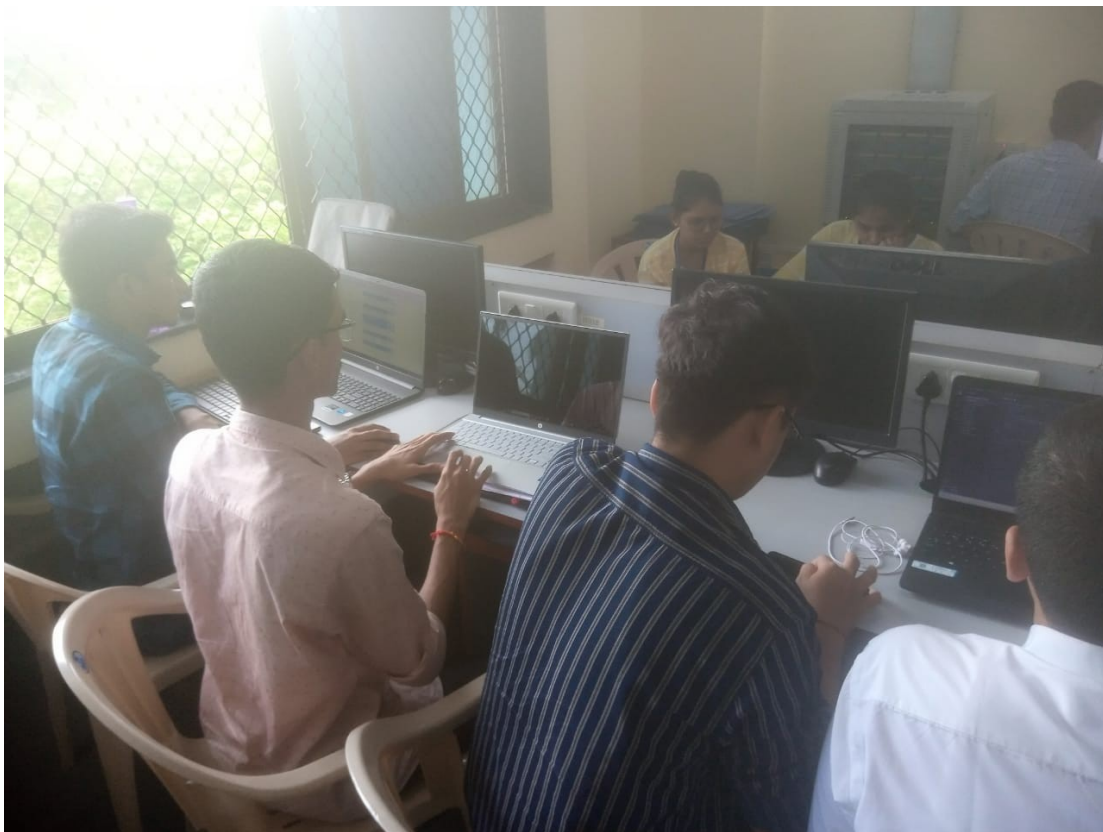
The student team is working on a Problem statement to solve real-life problem on Student Innovation