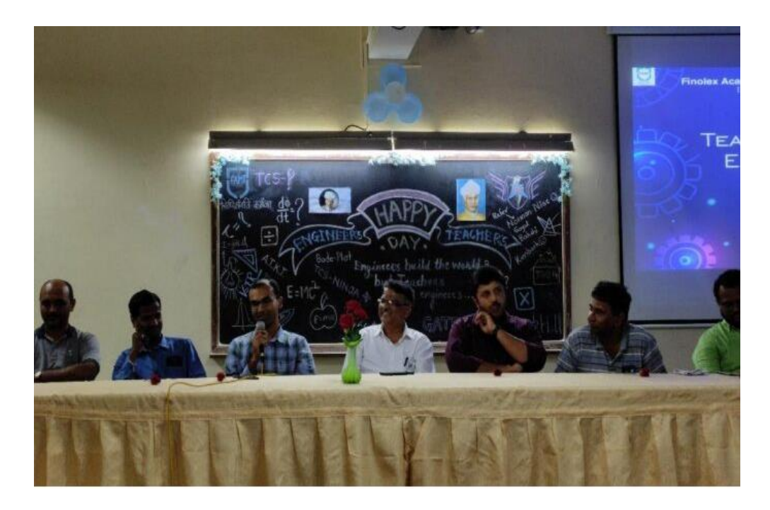
Teacher - Students interaction during the program

It was followed by Funny games for students as well as teachers.