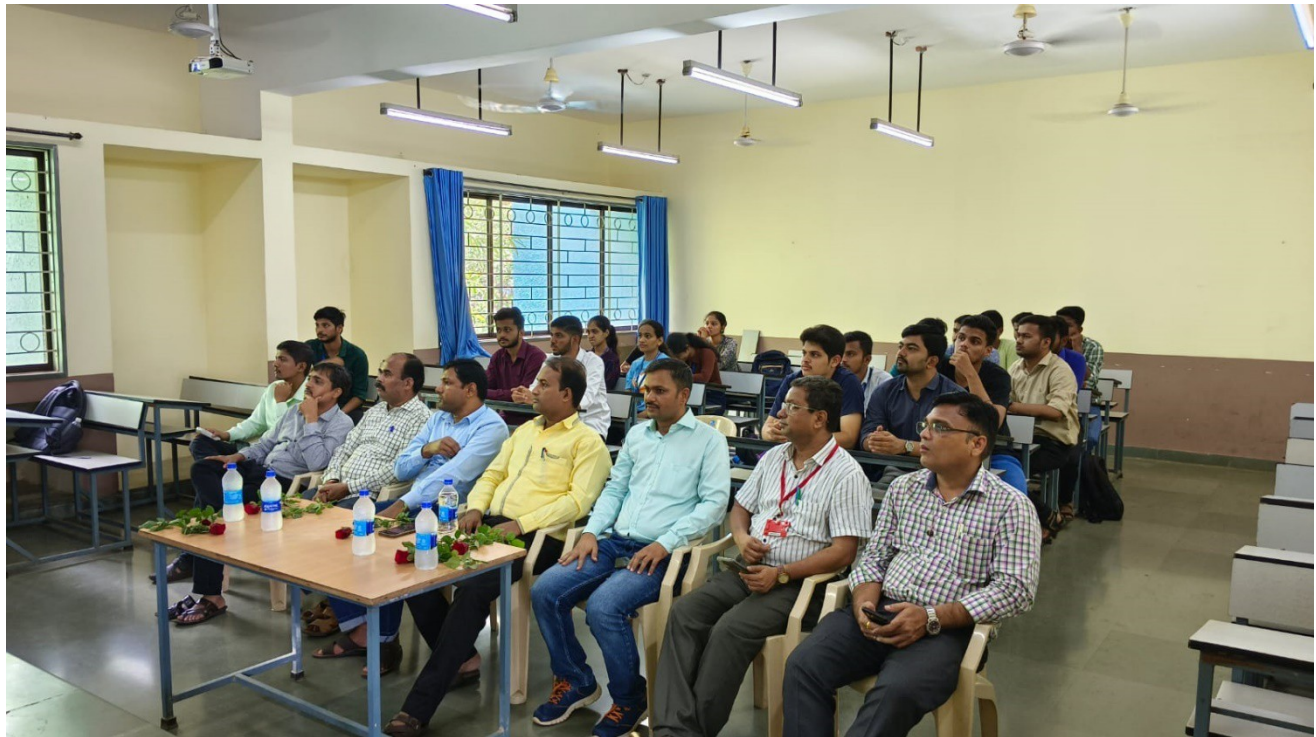
Departmental faculty and students listening to the talk