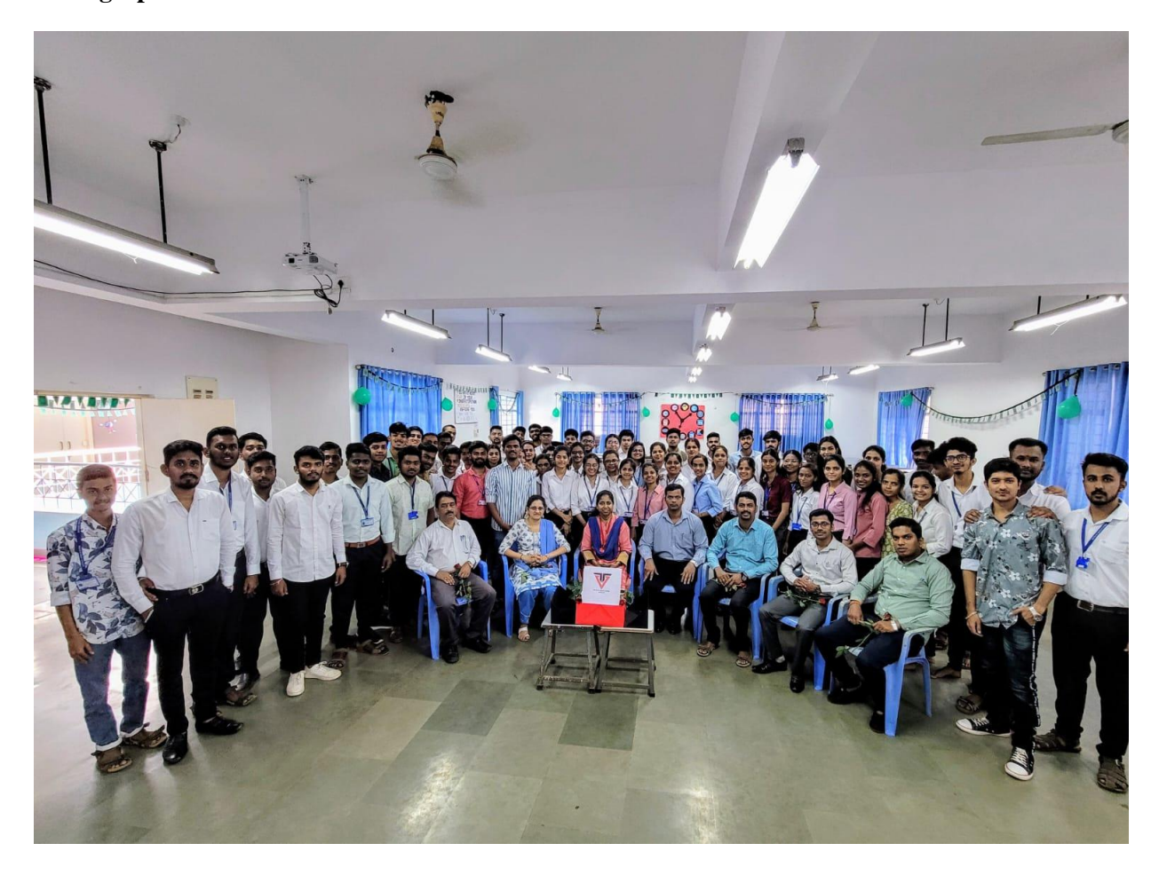
Inauguration of TechVenture2k23