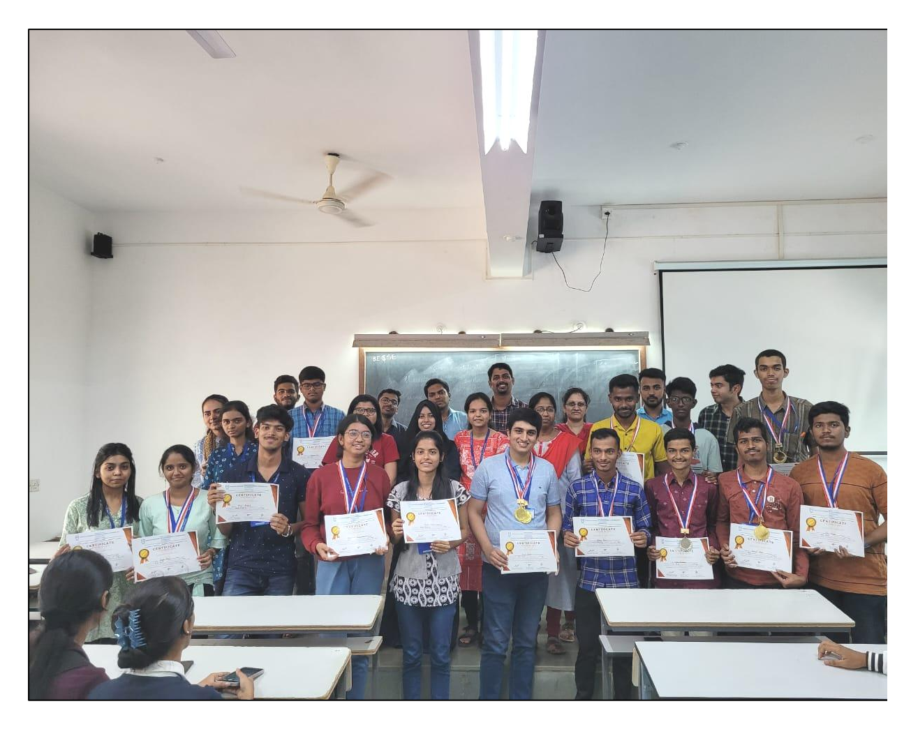
Group\ photo\ of\ all\ Prize\ winners\ of\ Tech Venture 2k23