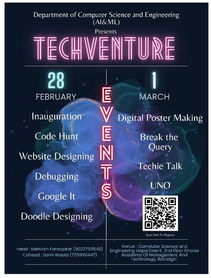
Pamphlet of TechVenture 2k23