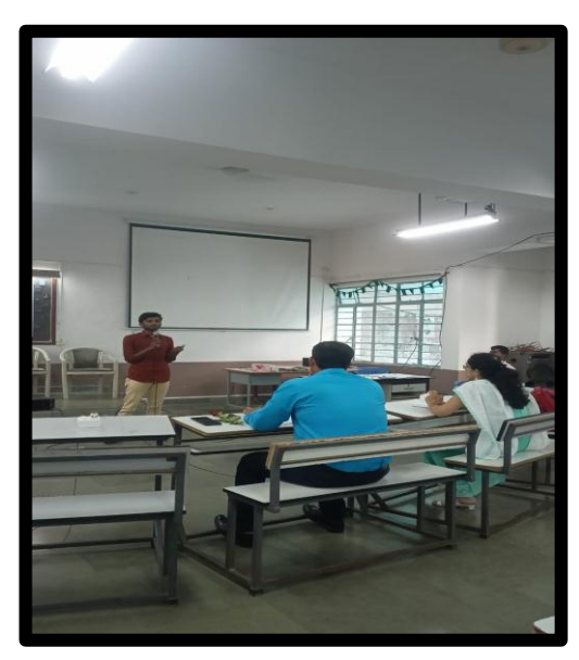
Participants in Debugging