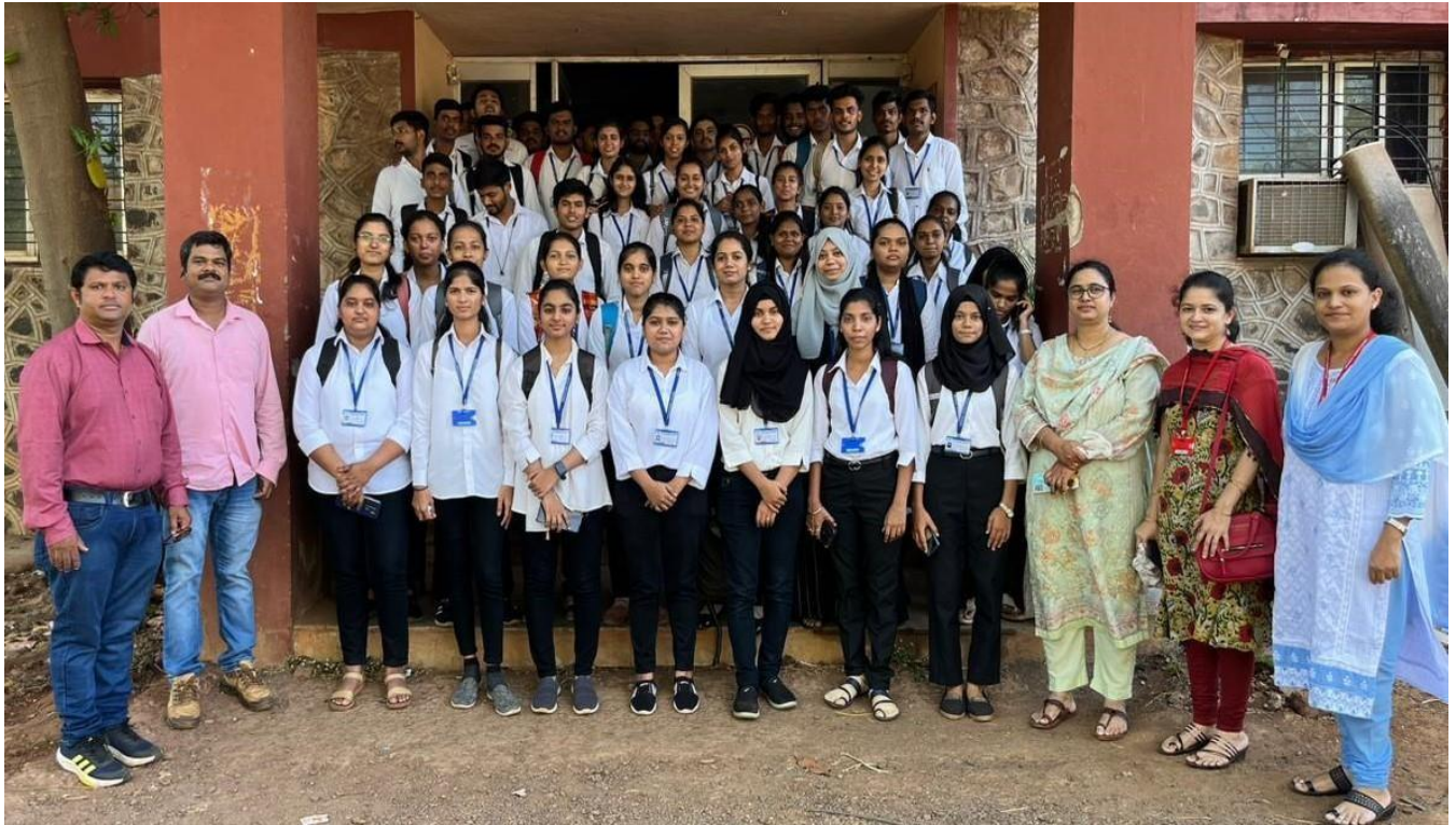
Students and Faculty members along with BSNL Staff members