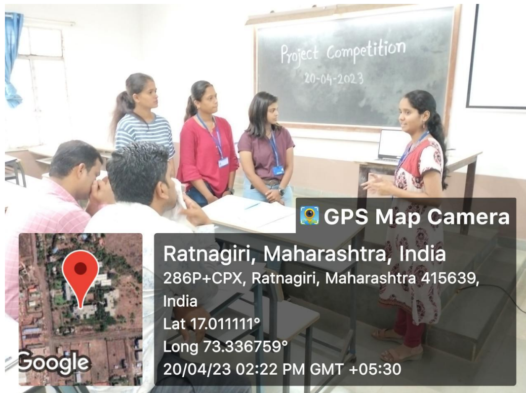
Students of S.E class giving a demonstration of their project