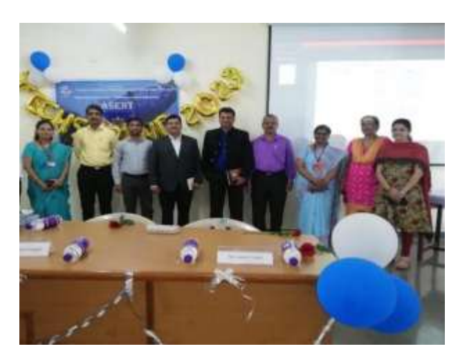
Inauguration of Techspring 2023