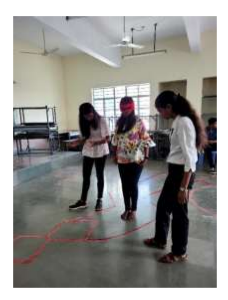
Participation of students in various events