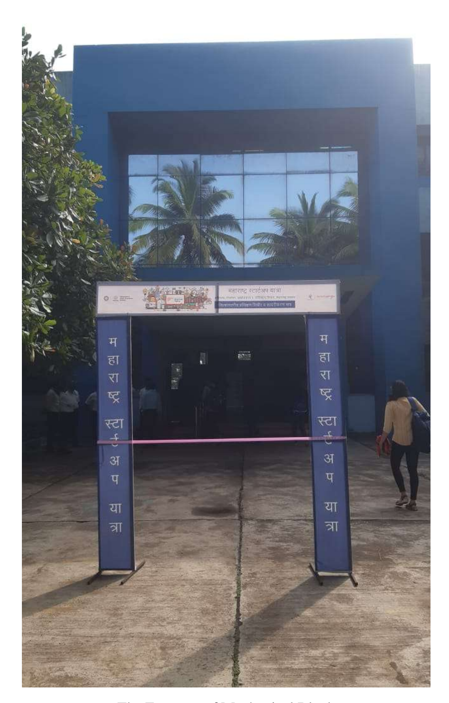
The Entrance of Mechanical Block