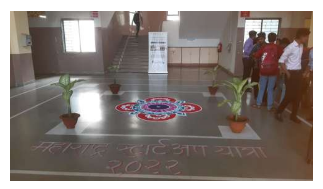
The Rangoli at the Entrance of the Mechanical Block.