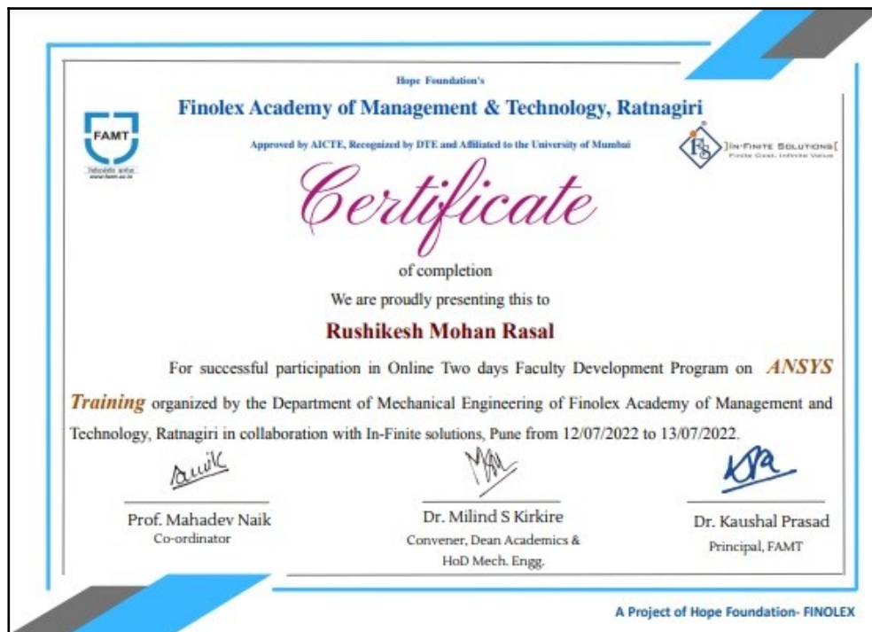
FDP certificate issued to participants