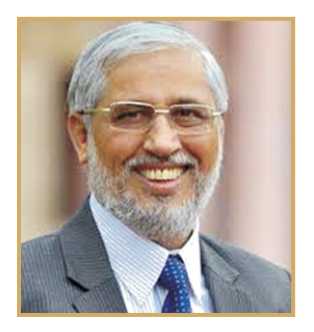
Anil D Sahasrabudhe Chairman, AICTE

I am very happy to see that the detailed guidelines have been issued by Ministry of Human Resource Development on National Innovation and Startup Policy for students and faculties of higher education institutions which further strengthens the Startup Policy released by All India Council of Technical Education in November 2016 from Rashtrapati Bhawan, just after few months of Startup action plan announced by the Government of India in January 2016.