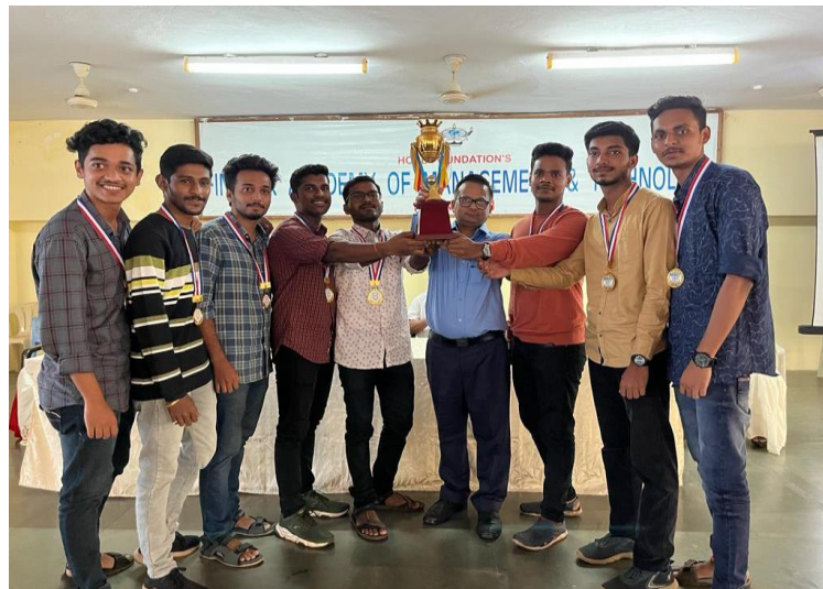
Prize distribution ceremony

P -60, P-60/1, MIDC, Mirjole Block, Ratnagiri - 415639