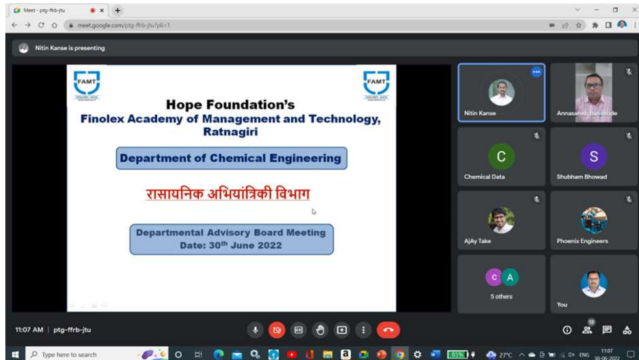
DAB members in the meeting