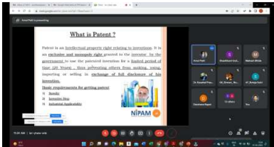
Glimpses of the IPR Awareness programme