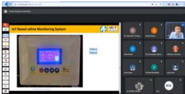
Dr Kakade exploring IOT based saline monitoring system