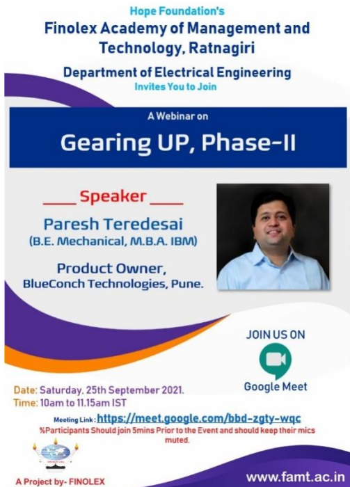
Poster of the event