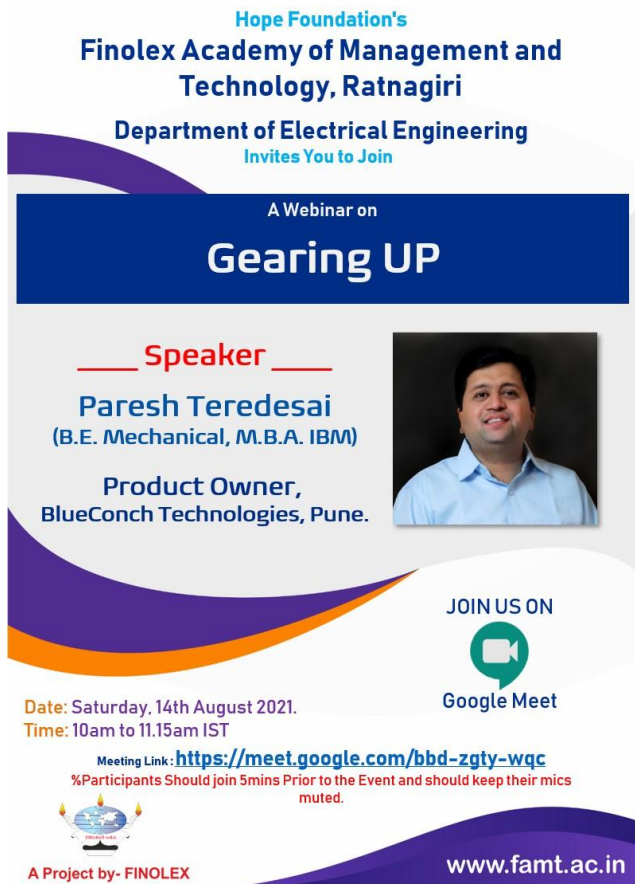
Poster of the event