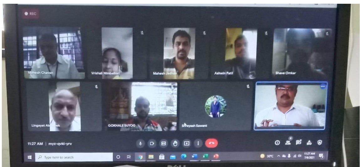
Discussion and suggestions session