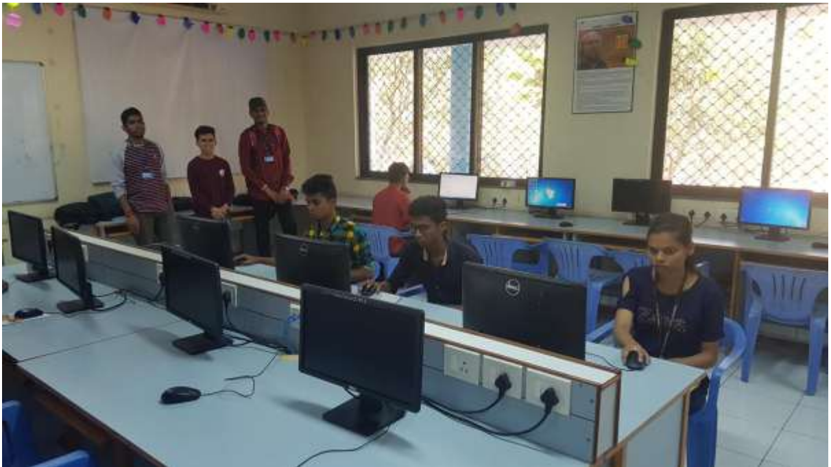
Code IT Event