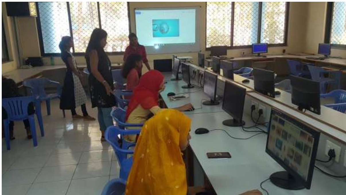
Google It Event