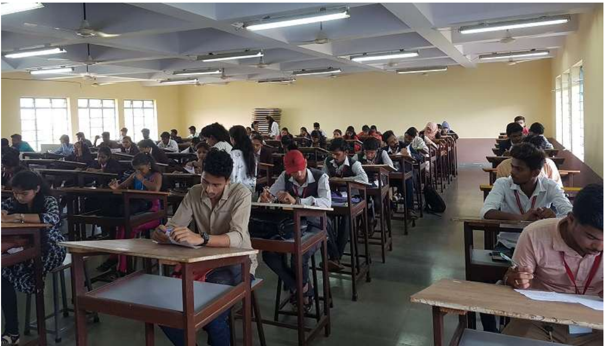
Participants of various colleges during the Second Round of IT Talent Hunt 2020