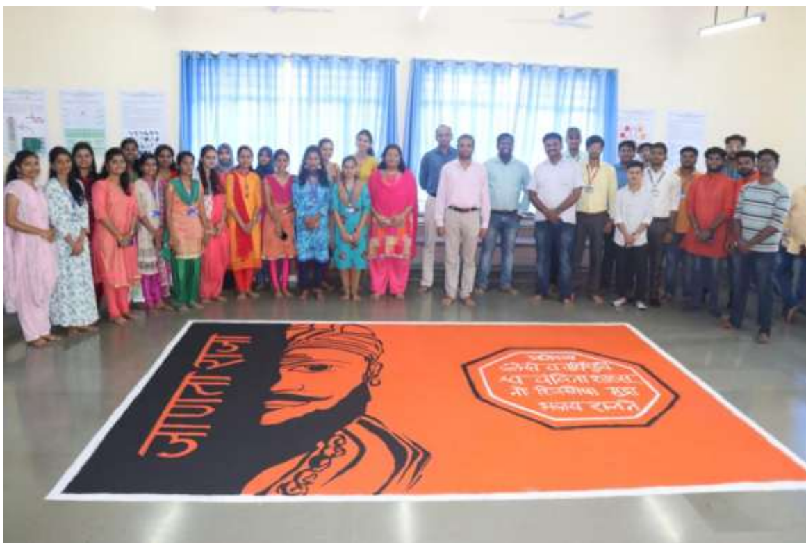
The faculty members and students of MCA Department after successfully organizing the exhibition for celebrating Chatrapati Shivaji Maharaj Jayanti