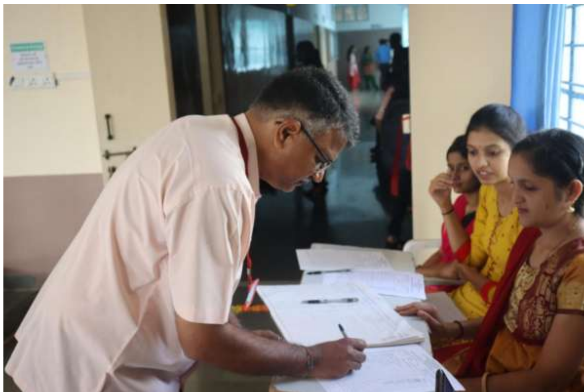
Faculty giving feedback for the exhibition