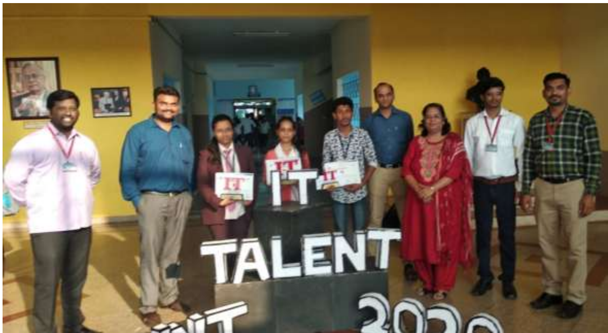
Department of MCA Faculty with the winners of IT Talent Hunt 2020