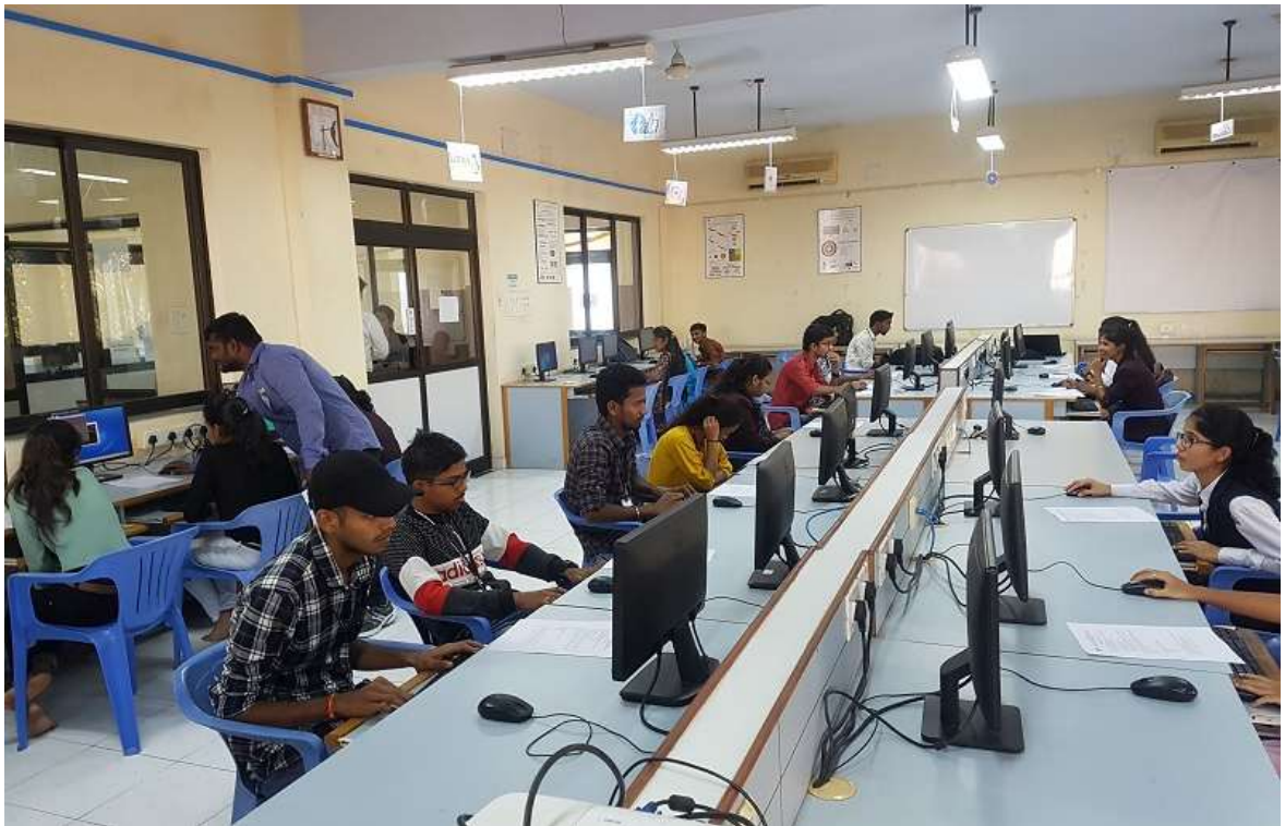
Participants of various colleges engaged during the Final Round of IT Talent Hunt 2020