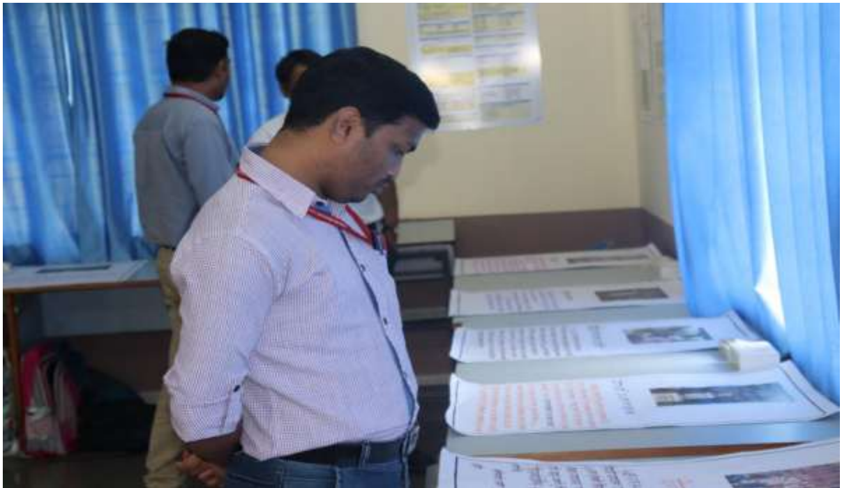
Faculty Members visiting the exhibition