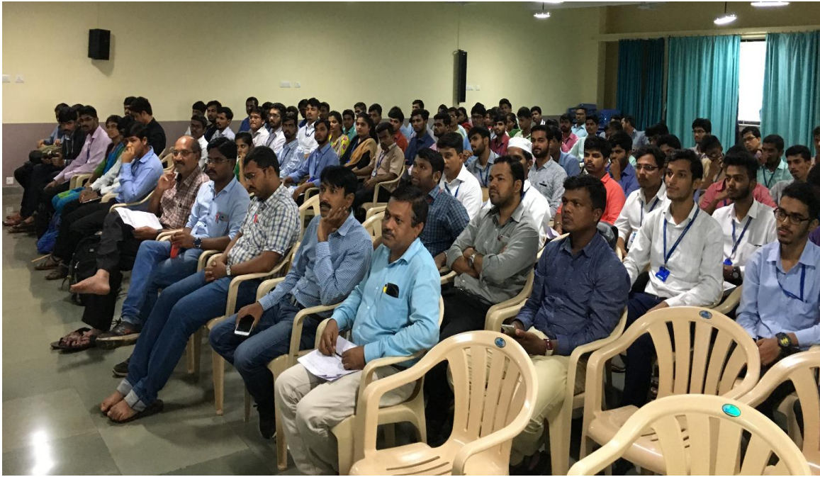
Audience participated in an event