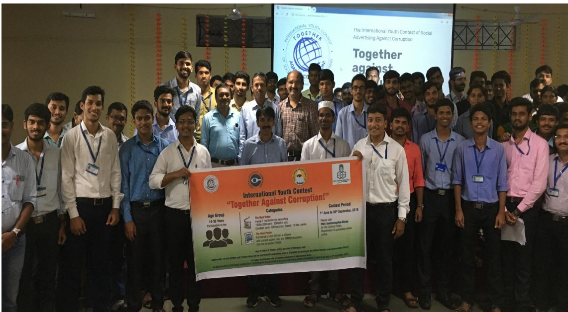
Students and Faculty members of Mechanical Engineering Department