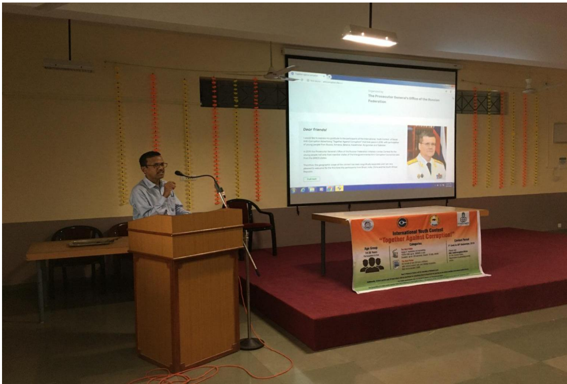
Mr.Margaz from RCF guiding students